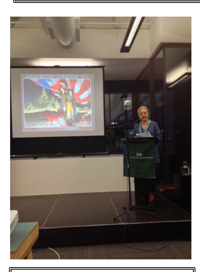
Tea, Zen and Cosmic Anatomy at the Turnbull Library, Wellington