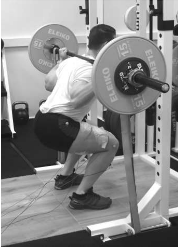
Figure 1. EMG electrode and infrared reflective motion analysis marker placement during the back squat exercise. Infrared reflective markers were placed over the lateral malleolus, femoral epicondyle and greater trochanter of the right lower limb to enable knee kinematics to be recorded, while EMG electrodes were positioned over the muscle bellies of the rectus femoris, vastus lateralis and medialis, and semitendinosus enabled muscle activity to be recorded. Elastic bands attached to the barbell provided an average of 35% of the total loading during the squat exercise.