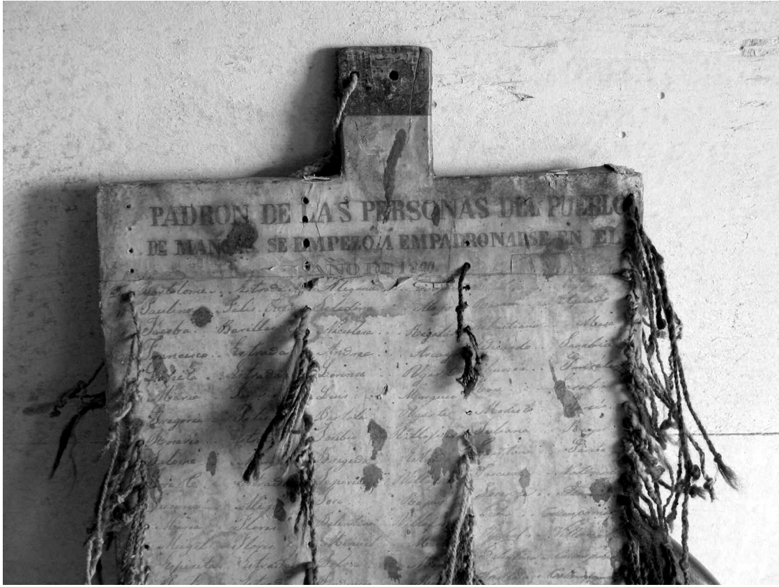
Figure 1. Mangas Khipu board Side A (top).

the text, 246 names are totally legible, 26 are partially legible (i.e., either the first name or the surname is readable), and 10 are totally illegible. 3 Out of 282 names, 143 are female names (50.7 percent), 108 are male names (38.3 percent), and 31 names are of an unknown gender (10.9 percent) because the paper is damaged by the first name. Each full name occurs only once on the khipu board. Next to each name is a hole out of which comes, in many cases, an associated khipu cord. The cords, identified as sheep's wool by local informants, go through the holes in the board and have a single knot at each end of the cord. Except in cases where the cords are deteriorated, they fit very snugly in the holes; however, they are not attached to the board in any other manner. The cords exhibit Inka khipu color patterns, such as barber pole and mottled; their range of color, ply, and other characteristics are described further below.