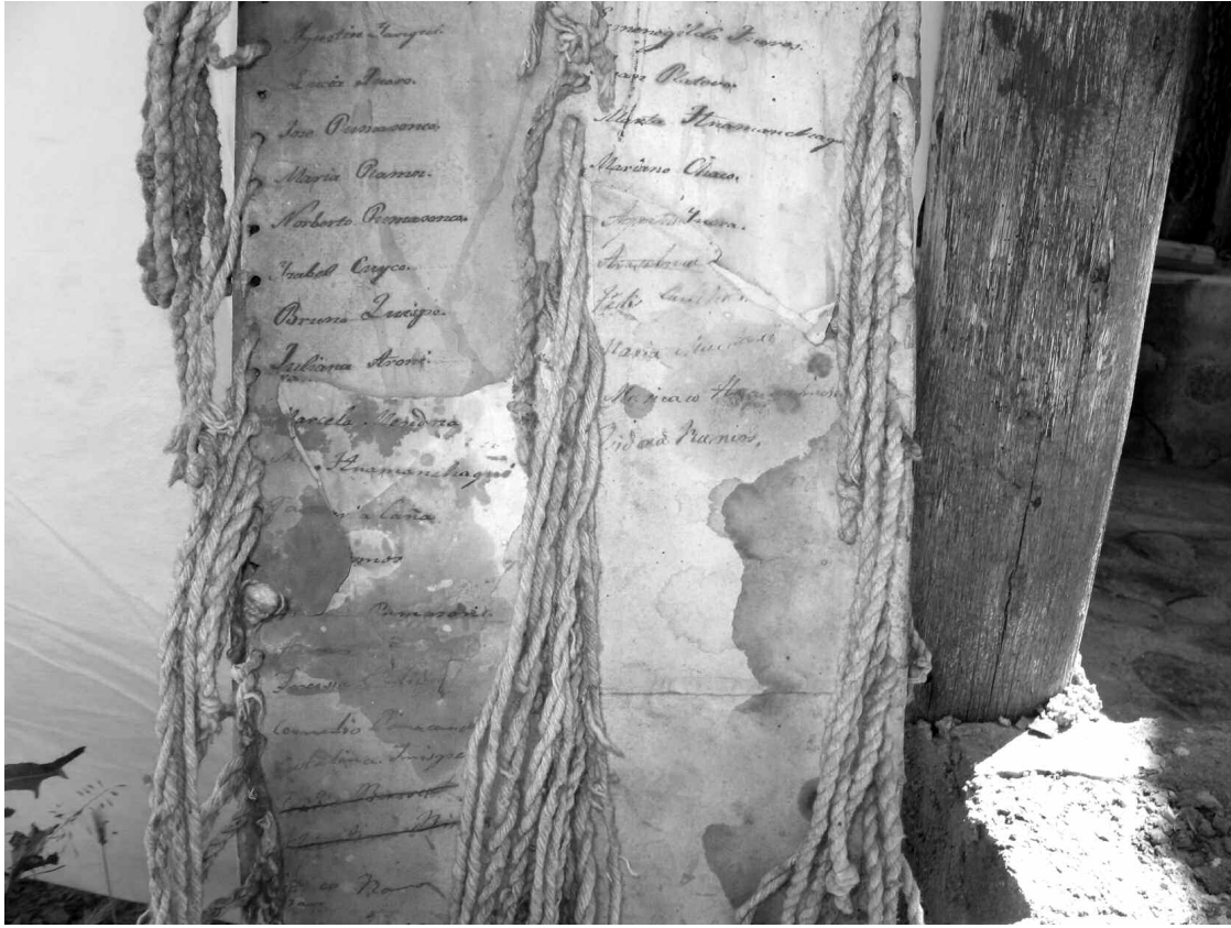
Figure 5. Ayacucho Khipu board.

is preceded by a hole from which often comes a cord (Figure 3). There are four columns of cords on Side B; the rightmost column of cords on Side B does not correspond to any name on the back but instead corresponds to the first column of names on Side A.