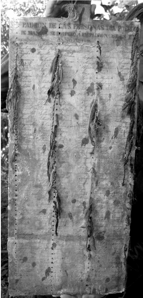
Figure 2. Mangas Khipu board Side A.