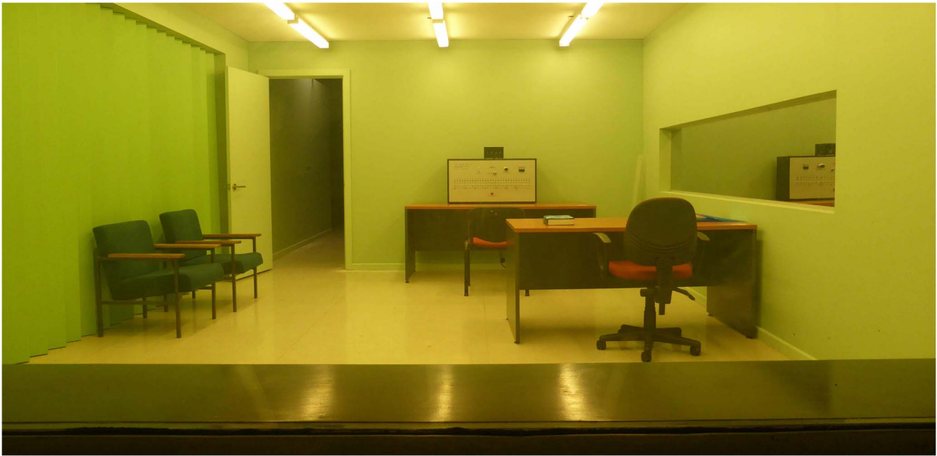
Figure 1. The set for the research laboratory. doi:10.1371/journal.pone.0109015.g001

corresponding variants of Milgram's studies ( 344.8; t(13) = -1.82, p = .09 ). It is also significantly greater than the midpoint (249.0) between the mean maximum shock that Milgram's participants estimated they would deliver (146.4) and the mean maximum shock that they actually delivered ( 344.8; t(13) = 2.32, p = .04 ) – indicating that responses were closer to the latter than the former.