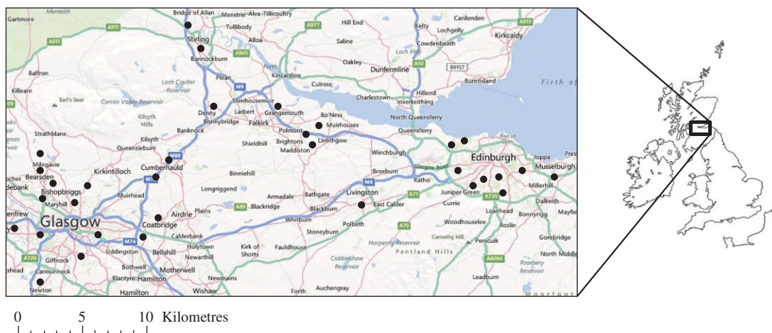
Figure 2. Map of central Scotland showing approximate locations of woodland sites (black dots) surveyed in 2011.