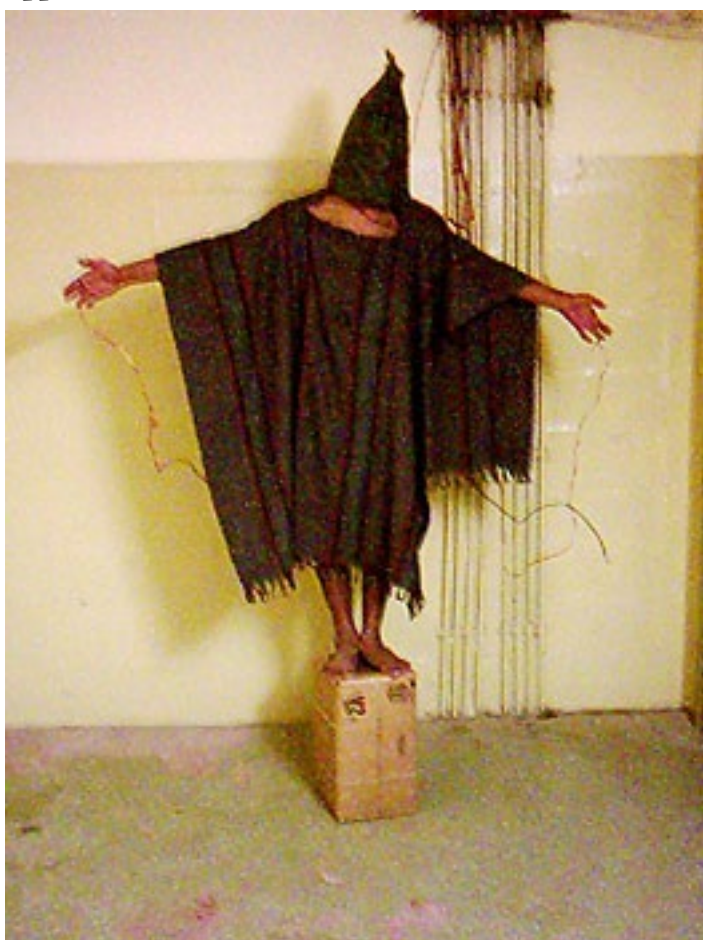
US Military Personnel (2003) “Hooded Man.

This image is in the public domain, as justified by Wikimedia Commons: “This image is in the public domain because it is ineligible for copyright. This applies worldwide. Pictures taken by U. S. military personnel as part of that person’s official duties are ineligible for copyright. The photographers of the Abu Ghraib prisoner abuse photos have asserted this was the case under oath.” Accessed on 17 / 07 / 13 at: http://en.wikipedia.org/wiki/File:AbuGhraibAbuse-standing-on-box.jpg