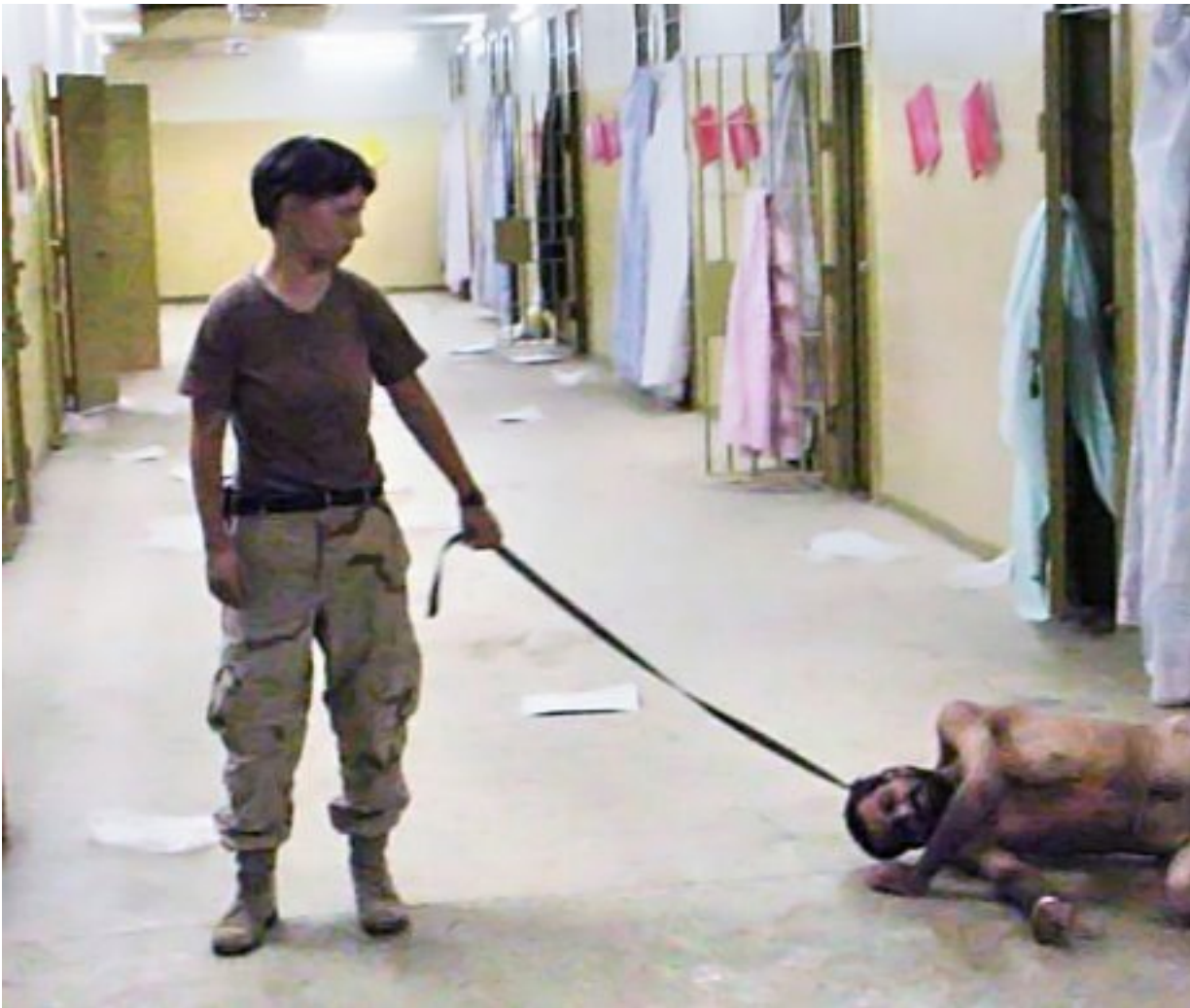
US Military Personnel (2003) “Soldier with Abu Ghraib prisoner on leash”

Ibid. Accessed on 17 / 07 / 13 at: http://en.wikipedia.org/wiki/File:Abu-ghraib-leash.jpg