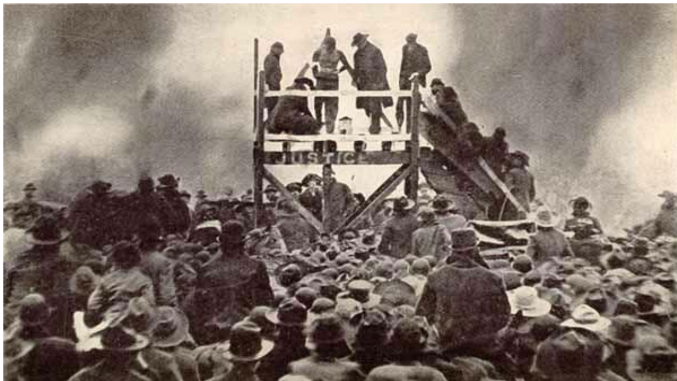
The lynching of Henry Smith in Paris, Texas, 1893. Photographer: Anonymous. Accessed on March 25, 2014 at: http://en.wikipedia.org/wiki/File:Henry-smith-2-1-1893-paris-tx-2.jpg