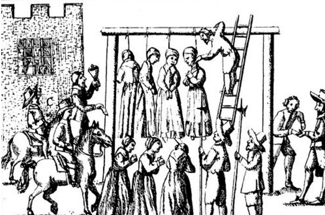
Illustration of witches being hanged, from Ralph Gardiner's England's Grievance Discovered in Relation to the Coal Trade , 1655. Published in A New History of Witchcraft by Brooks and Alexander (2007), page 69. Accessed on March 25, 2014, at: http://en.wikipedia.org/wiki/File:Witches_Being_Hanged.jpg