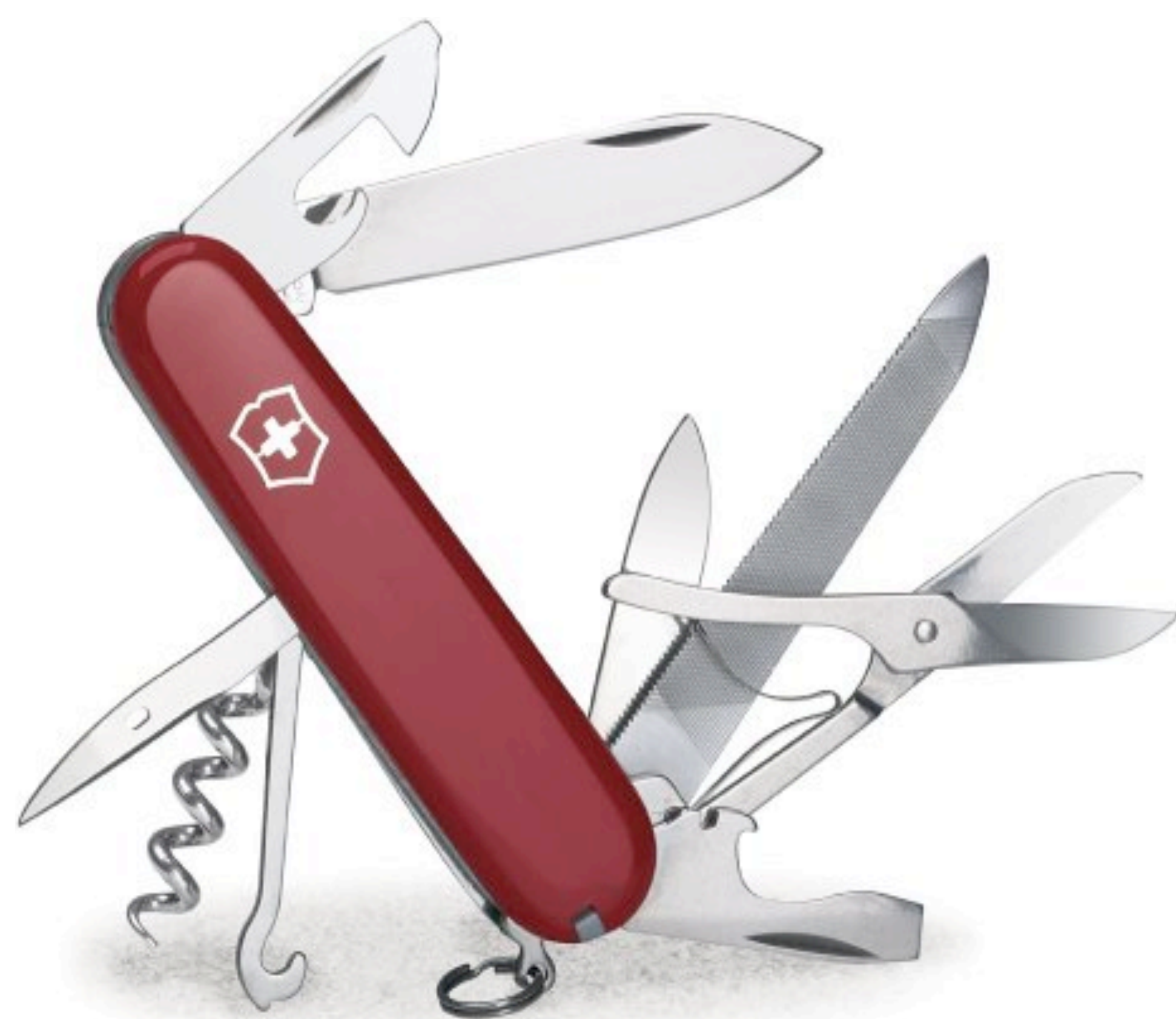
LMS Tool Use at Haverford College Average number of courses per semester, fall 2013 - spring 2016

Have you used any of these tools? Would you like to try any of the tools? Let us know!