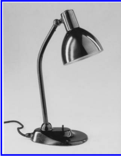
Figure 4 Marianne Brandt and Hin Bredendieck, desk lamp, 1928, manufactured by Körting & Mathiesen (Kandem no. 756), 18½ in. (Bauhaus-Archiv, Berlin,)

“trivialization” of the Bauhaus legacy. Is there a Bauhaus legacy in building and the applied arts, and if so, is it worth having? If there is such a legacy, is it the product of nostalgic revivals, or is it part of a continuous evolution? Does it come to us only from the Bauhaus, or from a much broader group of design and building efforts in Germany and other countries in the twenties and thirties? And how has it been transmitted? By contemporary shows and publications, by individual émigrés, by the Museum of Modern Art in 1938 and other museums since that time, by political patronage during the Second World War and the Cold War era? Or by underlying forces of modernization over the last ninety years? No one of the exhibitions of the “Bauhaus year” approaches more than a few of these questions, but collectively they do shed light on many of them. Maybe the time is ripe now for a new, comprehensive, and scholarly history of the school, its origins, development, context, and heritage—a history that now more than ever needs to be written.