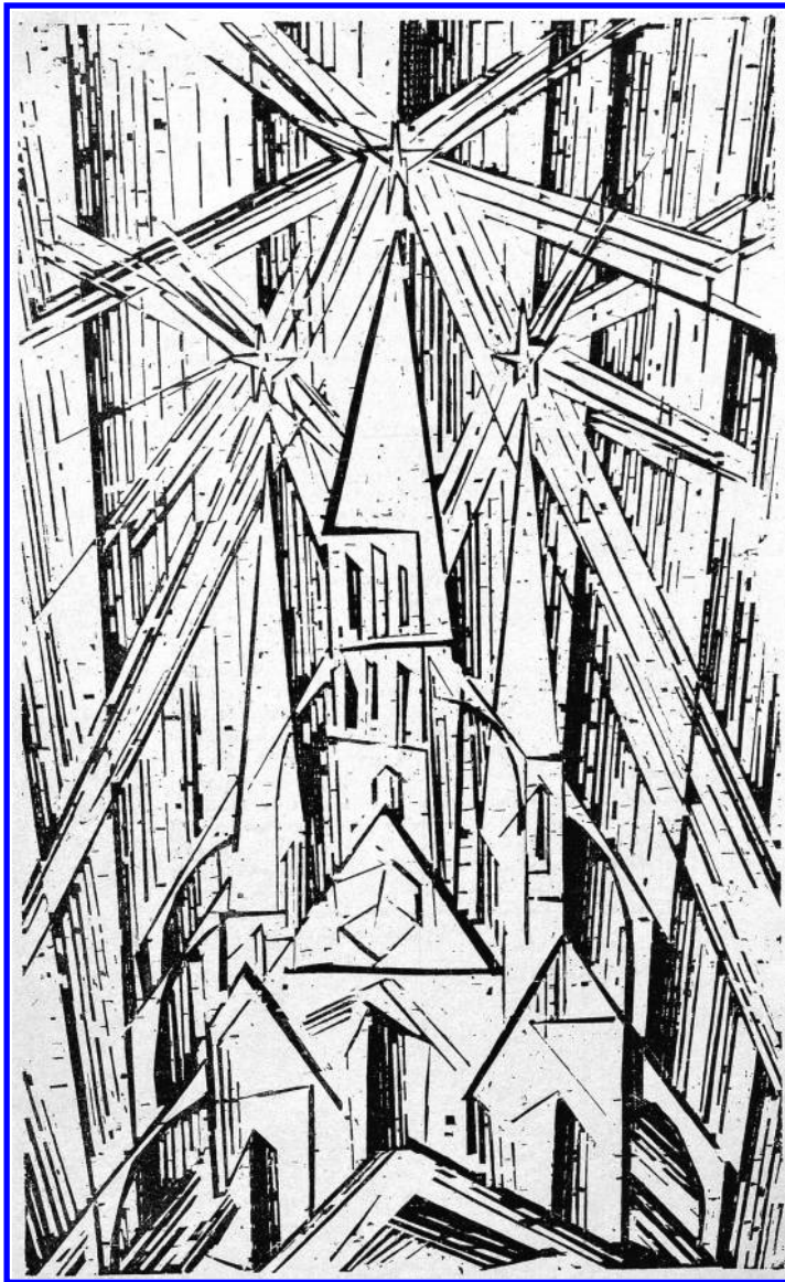
Figure 1 Lyonel Feininger, Bauhaus manifesto, April 1919 (The Museum of Modern Art, New York, and Harvard Art Museum, Busch-Reisinger Museum. Gift of Julia Feininger)

hands as the crystal symbol of a new faith” (Figure 1). 3 But in New York it was possible to see the manifesto in the context of other work of the time: Johannes Itten’s cover for a planned periodical called Utopia: Documents of Reality , Lothar Schreyer’s tempera design for a coffin ( Death House of a Woman , displayed in its own sarcophagus-like case), woodcuts by Gerhard Marcks that illustrate warlike scenes from The Wieland Saga of the Elder Edda , Marcel Breuer’s “African” or “Romantic” chair, and Theobald Müller-Hummel’s carved and painted wooden propeller blade, titled Pillar with Cosmic Visions .