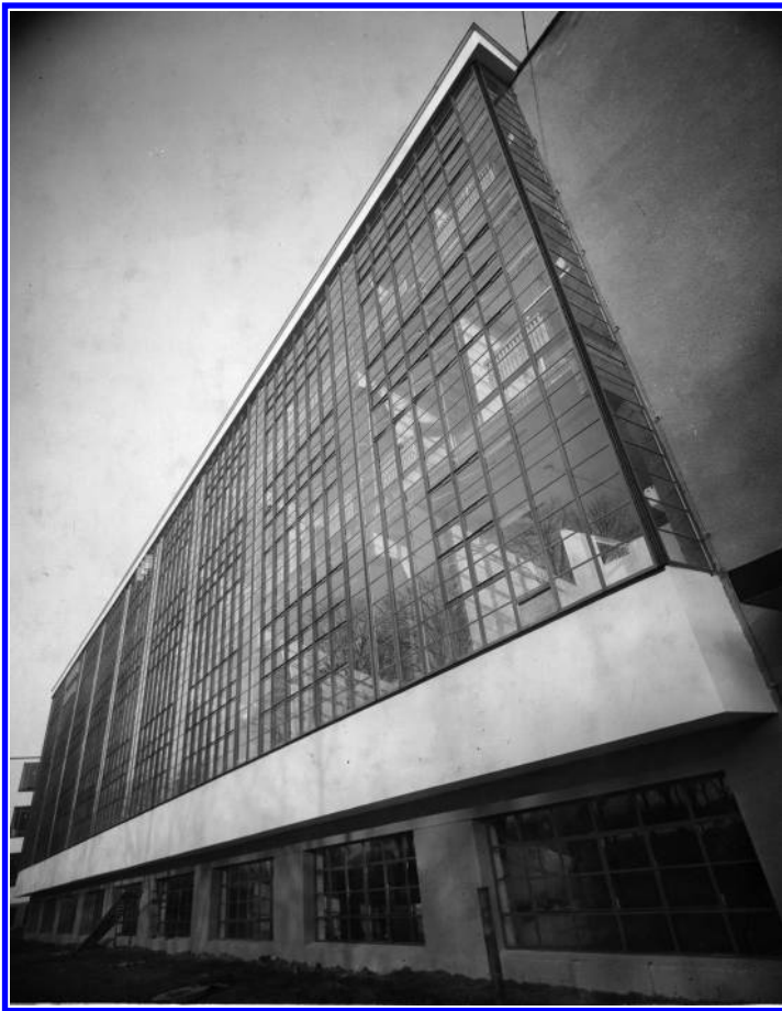
Figure 3 Lucia Moholy, Bauhaus Dessau, workshop building from below, Sept. 1926. Gelatin silver print, 13 \frac{7}{8} x 10 \frac{11}{16} in. (The Museum of Modern Art, New York. Thomas Walther collection, gift of Thomas Walther)

German Trades Unions School buildings in Bernau near Berlin (1928–30) have also been very recently restored. Extant buildings of this size and importance cannot be adequately documented, especially for non-German viewers, by small archival photographs, many of them very partial, a few plans and isometrics, and a small-scale (1:100) model from 1999. The rather few original photographs of the Dessau school that were shown in New York, such as the view of the workshop wing by Lucia Moholy, are important to study, but they do not represent the buildings well (Figure 3). Meyer’s building fares somewhat better in contemporary images, but here too, the results are inadequate. Meyer’s school was very different from the Gropius buildings in materials and architectural expression, and this is almost impossible to appreciate without modern color photography.