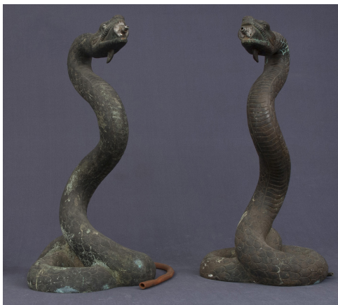
Bronze sea serpent fountain ornaments