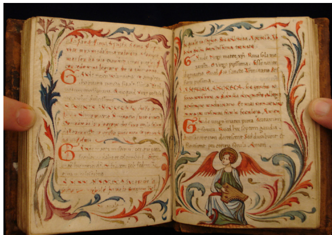
Italian liturgical manuscript, late 15th century.