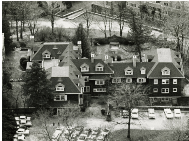
Aerial view of the Deanery, 1960's

NH: I have been thinking about the Deanery since 2008, when Visual Resources digitized the slides taken shortly before the Deanery was demolished. The images of the Blue