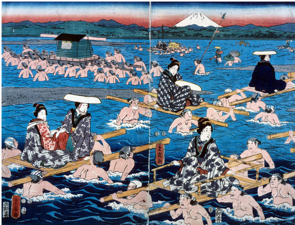
Crossing the Ōi River, detail. Utagawa Hiroshige II (Shigenobu). Date unknown. Gift of Margery Hoffman Smith, Class of 1911

status and wealth. Yet, as can be seen in most ukiyo-e bijinga , red was a favored color in Edo Period fashion. Inventive textile manufacturers imitated forbidden pigments in order to indulge popular tastes and circumvent sumptuary laws. In similar disguise, wealthy but low-ranking women would have their undergarments dyed in the coveted beni red, a luxury too