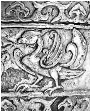
9B Detail of 9A. From Andersson, Mediaeval Drinking Bowls , pl. 15B

9A Cup, Byzantine, discovered in Dune on the Island of Gotland, Sweden, tenth or eleventh century. Silver, height 6 cm, diameter at lip 10.6 cm. Historiska Museet, Stockholm, 6849:5. From Andersson, Mediaeval Drinking Bowls , pl. 15A