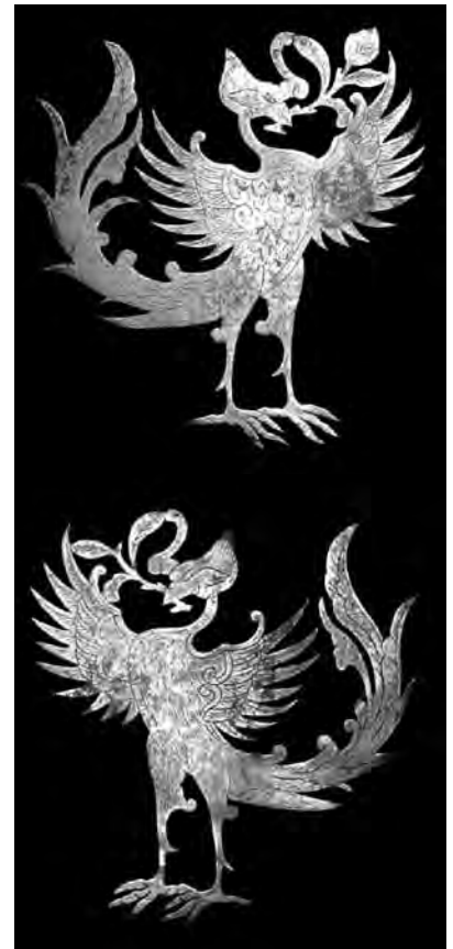
4 Mirror, Tang dynasty, 618–907. Bronze, width 26.4 cm. Freer Gallery of Art, Purchase, F1929.17