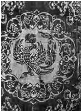
3B Detail of 3A.

attitudes toward foreign places and peoples and the artistic forms that served as their surrogates. 12 This emphasis is dictated in part by the limited evidence documenting the process of the feng huang 's movement to the west, which makes it impossible to arrive at any definitive explanations of the mechanics of its transference. But the approach is also motivated by an abiding interest in what adoption of the feng huang might reflect about Byzantine attitudes toward exotic eastern cultures. This essay operates from the premise that Byzantine viewers' understanding of foreign works of art was embedded in (and can be deduced from) the ways that Byzantine patrons and designers chose to redeploy these models in their own artistic production.