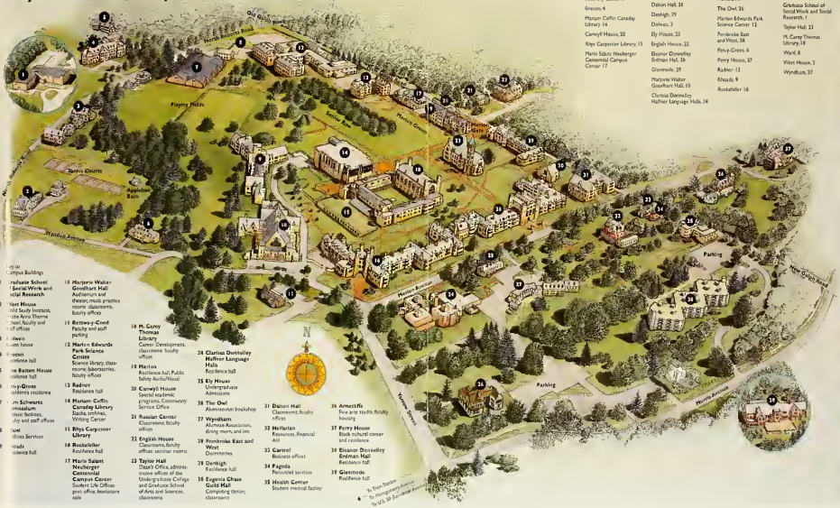
100 Campus Building