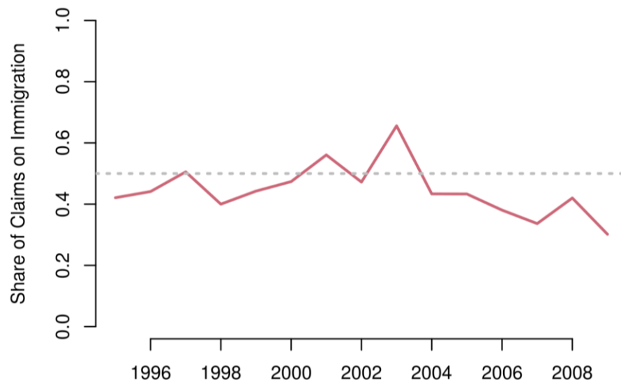
Figure 1: Share of claims by left-wing parties over time

Notes: The dashed line indicates 50% of claims; overall 57% of claims are made by right and centre-right parties, with 43% of claims being made by left-wing parties; see Table A1 and A2 in the appendix for the distribution by country and the distribution of different kinds of left-wing parties over time.