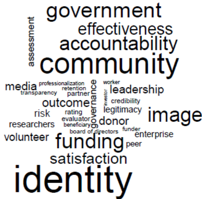
Figure 2 - Word cloud for nonprofits’ reputation (Absolute frequency).

External stakeholders—especially those bringing resources into nonprofits—play an important role in reputation. The high frequency of stakeholder-related terms, including community, government, and donor, is a clear evidence of this. Perceptions of reputation are, therefore, largely examined from an external stakeholders’ viewpoint, while volunteers are most frequently cited at the domestic level. This discrepancy in terms’ frequency can best be visualized in a word cloud (see Figure 2), in which the size of a word is proportional to the number of times the term is mentioned in the selected articles.