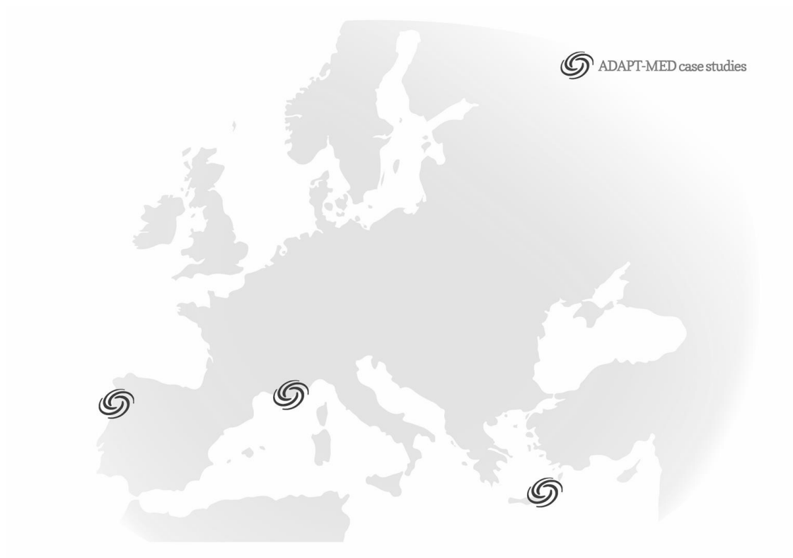
Figure 2. Location of the case studies in Portugal (BVL), France (SCOT-PM), and Greece (Heraklion - Crete).