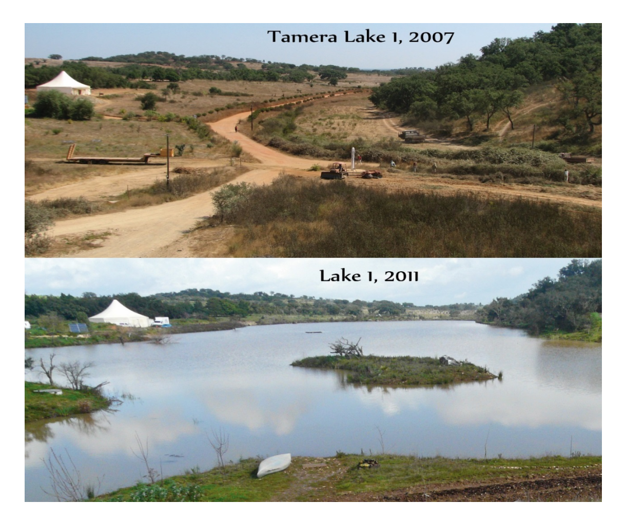
Figure 5: Before and after the construction of Lake 1.

as well as biogas digesters, developed by engineer Thomas H. Culhane<sup>25</sup>, which turn food waste into a source of fuel for food processing, as well as into soil fertilizer. Thanks to a Permaculture system known as the Water Retention Landscape (WRL, Figure 5), which combines rainwater conservation, reforestation and soil regeneration, Tamera became fully autonomous in terms of water usage in 2011. The purpose of the WRL is not to promote complete autonomy in food production, but again to demonstrate how to regenerate ecosystems and sustain life in degraded areas. The soil regeneration promoted by the WRL led to a significant increase in the quantity and diversity of plant species, which, besides serving as an edible "food forest", created a diverse habitat that attracted native wildlife species that have previously disappeared from the area. The increased biodiversity supported the resilience of crops by controlling pests and enhancing pollination. According to Tamera's Ecology Team, thanks to the WRL, in 2015 the community was producing about 14% of the food consumed within its premises. About 65% was bought from organic farmers in the region, while the remnant was imported.