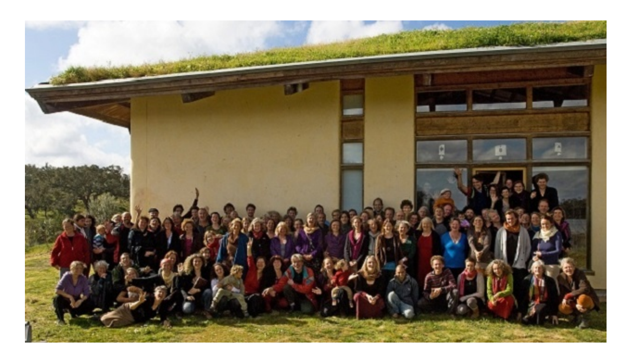
Figure 3: Group picture of the Tamera community.

The socio-economic standing of Tamera community members contrasts with the surrounding villages, but also Portugal as a whole. This is to a large extent a result of the internal economy of the community, and also because of the criteria for accessing membership, which creates selective pressures that favor people with the following characteristics: