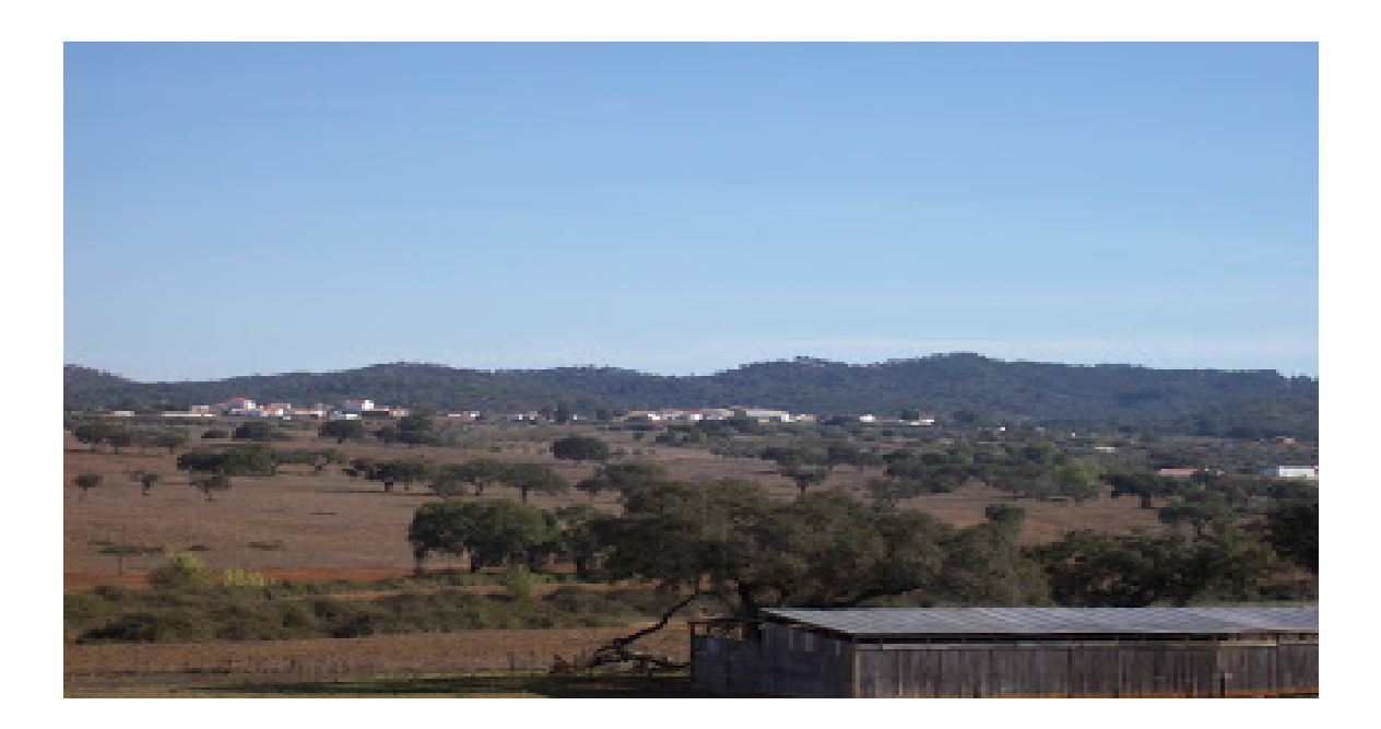
Figure 2: View of Colos from nearby Monte das Ferrarias.

European tourists and expatriates, who tend to keep to themselves and rarely mingle with the locals. These villages are located more than five kilometers away from Tamera. Their population decreased sharply between 1950 and 2011, from 3,515 to 931 inhabitants in Relíquias, and 3,045 to 1,005 in Colos. Tamera, in contrast with the homogenous, impoverished and ageing population of the surrounding villages, feels like a densely populated, youthful cosmopolitan hub, with a strong feminine presence in public spaces.