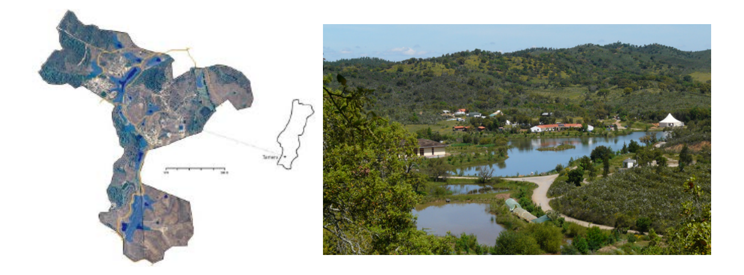
Figure 4: Views of Tamera's water retention landscape (WRL) showing lakes.

Tamera took advantage of the abundance of sunshine and rain in the region to begin the development of a commons-based economy, based on a strategy of ecosystem regeneration aimed at promoting autonomy in water, energy and food production. This strategy aims to be recognized as a replicable model for subsistence in autonomous communities, and for climate change mitigation. According to sources from Tamera's Ecology Team, the ecovillage was already producing 54% of all the electricity consumed within its premises in late 2015. This is thanks to experimental research on renewable energy-based technology that is being developed at Tamera's Test Field 1, including a Solar Village for pumping water, powering greenhouses and food processing and storage. This was envisioned by German physicist Jürgen Kleinwächter, CEO of Sunvention International GmbH.<sup>24</sup> The system is complemented by Scheffler mirrors,