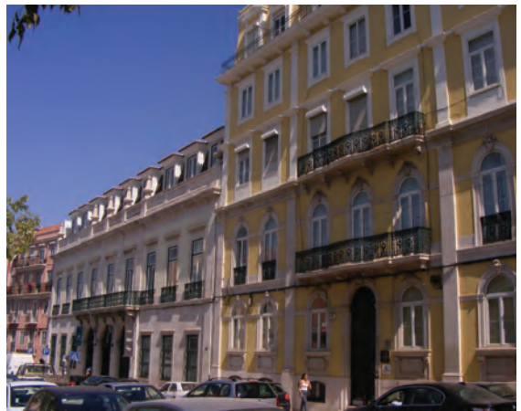
Figure 2: Príncipe Real

In a social mode of self-classification mainly based on disposable incomes and lifestyles, the interviewees made use of a class representation divided between what they called “middle class” and “upper middle class”. Despite the tendency for individuals to overstate their social