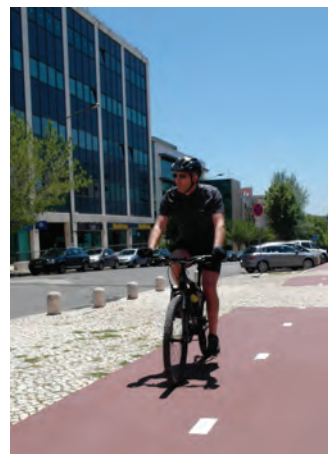
Figure 3: Telheiras