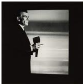
Figure 1. Jorge Molder, O pequeno mundo (The small world) , 2001. Series of 24 photographs, Black & White, 35cmx35cm.

Although, in these two cases, most of the discourses suggest that none of the characters is similar to the personal self, an embodied vision of social practices may say otherwise. Hence, the cases are often positioned equivocally or in an ambivalent way between the two genres – self-portrait versus self-representation, allowing undertaking a number of questions: beyond mimesis, what is there? In which conditions has this ambivalence been originated? In which way are artists, and other agents or observers participating in the creation of such a discourse? Which are its main effects? What about contingency, as contexts of creation and correlative relations with other images, texts, and signification structures representing a particular moment in time? How is artistic status created and reproduced? By what means are artists transforming their experiences of seeing and acting in ambiguous and (in)determinate narratives about the works of art?