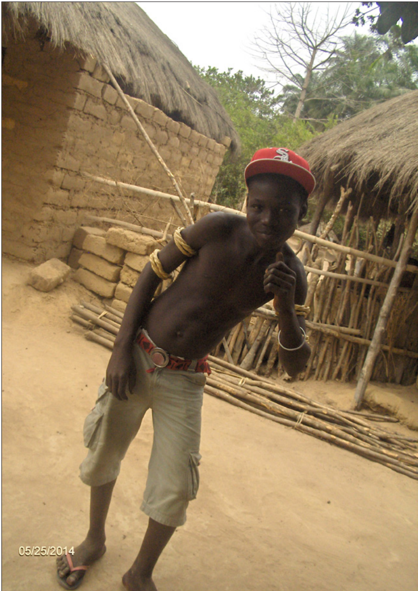
Fig. 5.

This is an ancient thing, called ngae , which the Balanta used to do in the past. Today it's difficult to find people that still put these lianas [malilas, kr.] on. People have changed. They wear good clothes and stroll around. In the past, youth would wear these lianas and would walk shirtless all the way to Bissau. I found this boy on that day, on the eve of his ninth birthday party, and I saw how he was dressed. I was very happy. Today, it is very difficult to find someone going shirtless. I took this picture to show the youth of today this custom that boys no longer do. In the past, this is how our elders would do. Why did this practice diminish? People have become careless. In the past, the majority did not go to school. That's why today, people want to kill this tradition so that the youth stay in school.