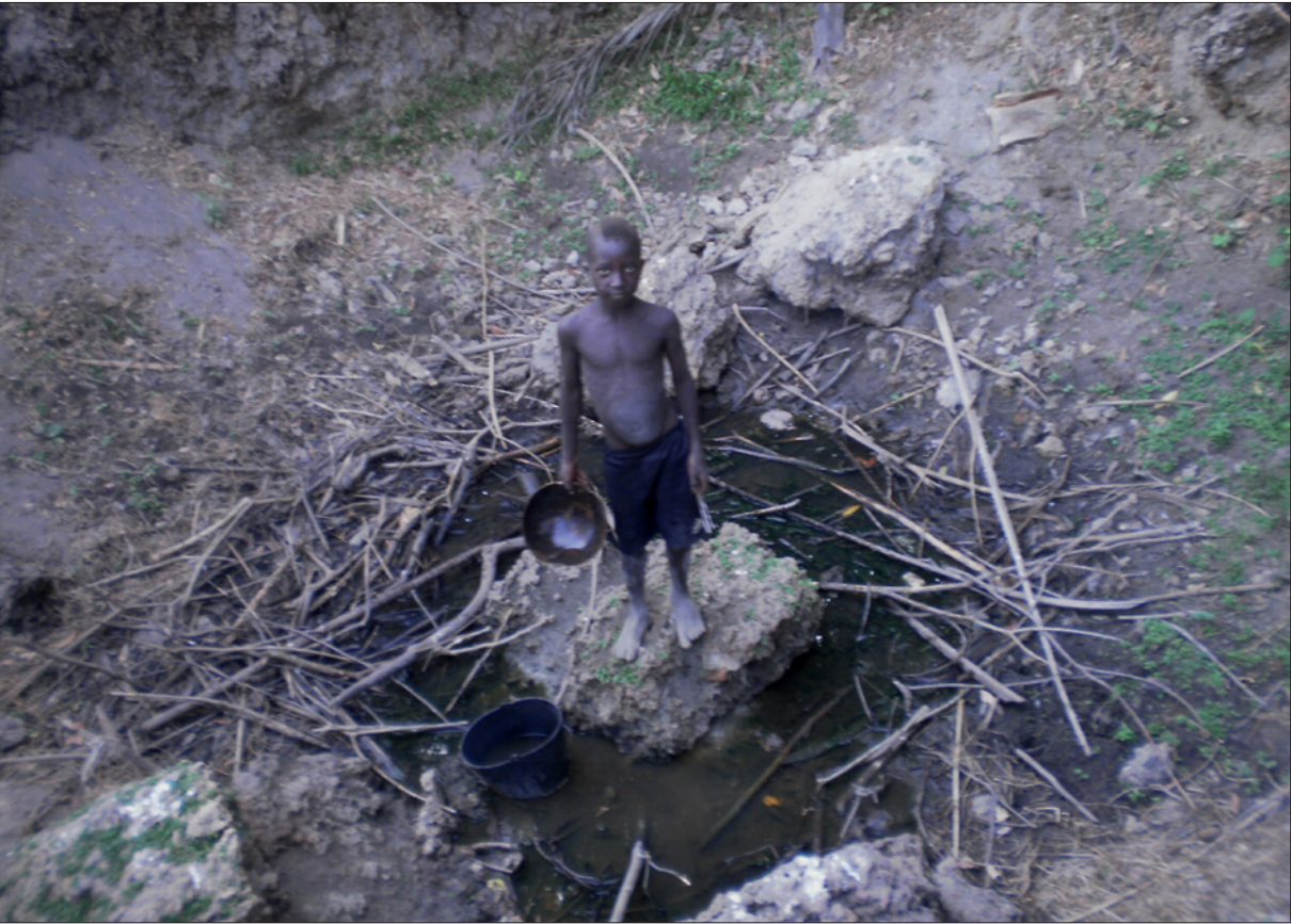
Fig. 2. Photo by Bulutna Nancussa (48 years old, farmer)

This is an old water spring. Do you see this boy with the calabash and his clean feet [i.e., bare feet]? The way he is standing there, inside the spring, with his foot on the ground [i.e., bare feet], he is fetching water to put in that bucket. In the old springs like this one, people would get in the water, fetch water and pass the bucket to their companion who hauls it up. What made me take this picture is that nowadays we have different water sources. The ones we have now are covered wells.