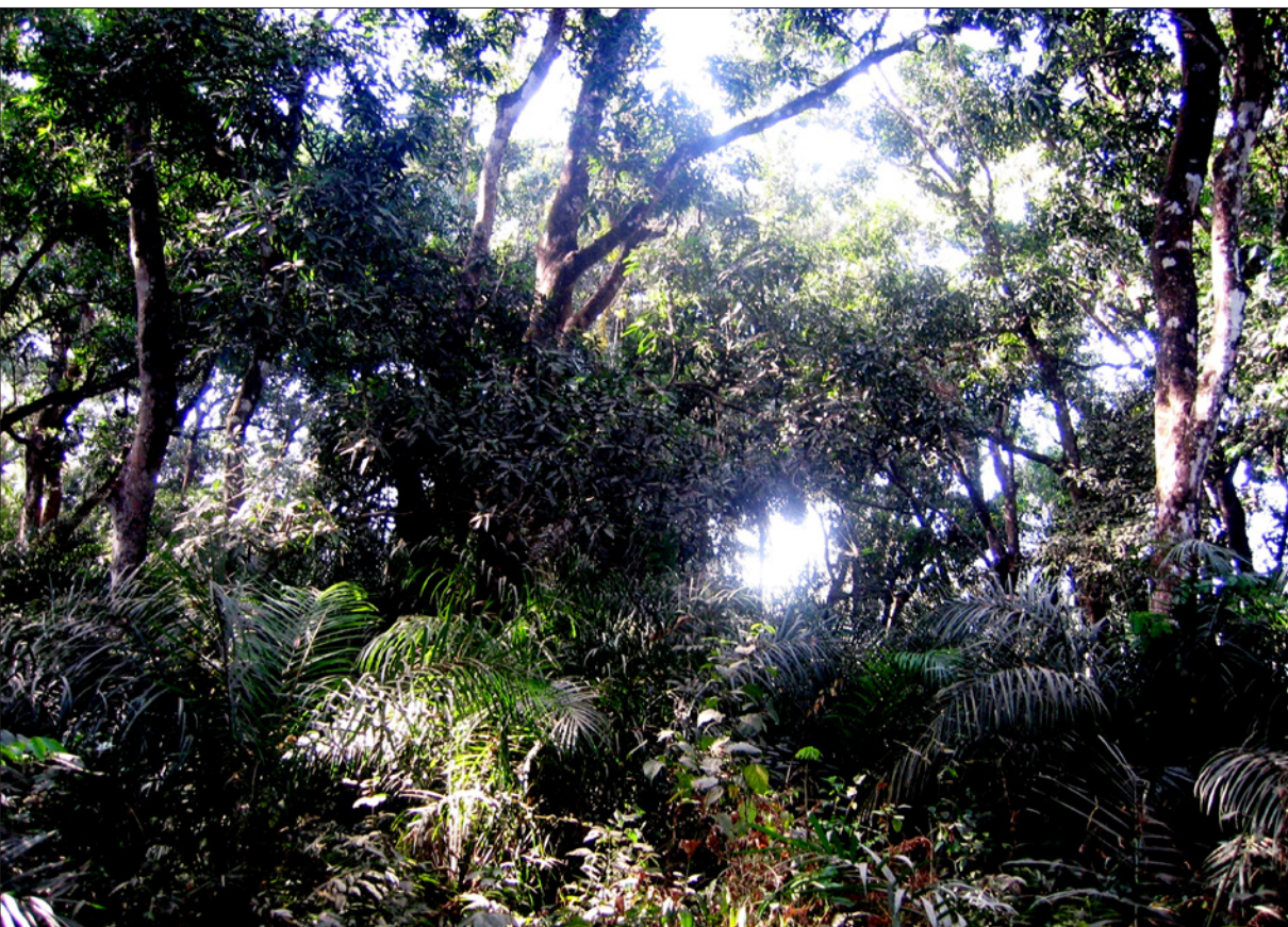
Fig. 17.