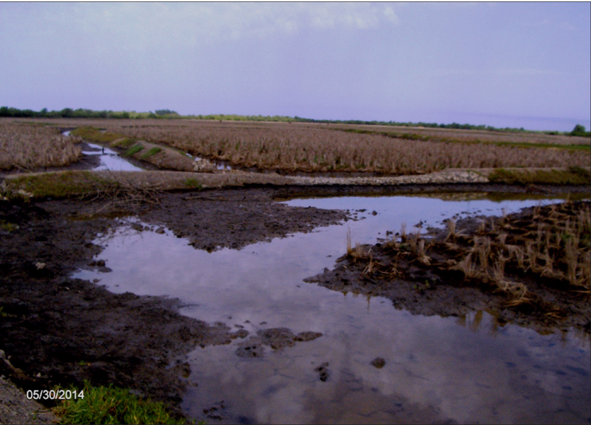
Fig. 10. Photo by Bebe Naman (31 years old, farmer)

I'm the one who took this picture. This is the bolanha (mangrove rice field; kr.) of Cadique-N'bitna. In the past, all of this was cultivated. But now it's all damaged and abandoned because (sea) water came from the river and destroyed the dikes [in 2008]. The main dike (dique de cintura; Portuguese) was close to the river, and it broke first. Then the other dikes lost their support and also broke down. Only that bridge that we see over there remained, where people still cultivate rice. Over there, they are restoring the bolanha. This is a change. My family is there. They were affected, they're suffering, they now have fewer cultivated parcels. People want to restore the bolanha and rebuild the main dike over there. Right now, people depend on cashew. They collect the nuts and trade them for rice.