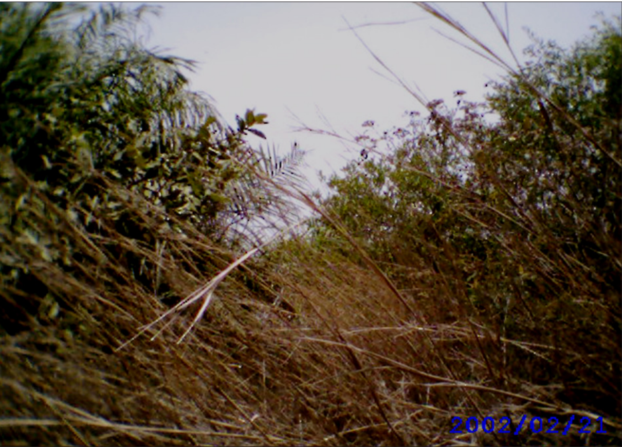
Fig. 12. Photo by Mussa Conté (44 years old, farmer, bike and motorbike mechanic)

This is a lala (a humid savanna) and this grass is karatá [a valuable roof thatching resource]. On the left is the forest. On the right is the mangrove. Today, the forest is coming in and taking the lala over and so the lala is getting finished. The mangrove is linked to the forest because the river has entered all the way to the forest. The forest and the mangrove are coming together to finish the lala. It's fresh water that has brought the forest. The land here has a slope. So, during the rainy season, water comes down from the village and accumulates here. With the entry of freshwater, the lala has lost its strength. Water always helps the trees. When it rains a lot, fresh water increases. But when there is little rain, fresh water decrease [...]. In the past, it used to rain a lot. But now rain varies: one year it rains a lot; another year, rain is little. One year, it may rain for only two months, August and September; another year, it may rain from May to October. In the past, it rained so much that houses fell down. It no longer happens.