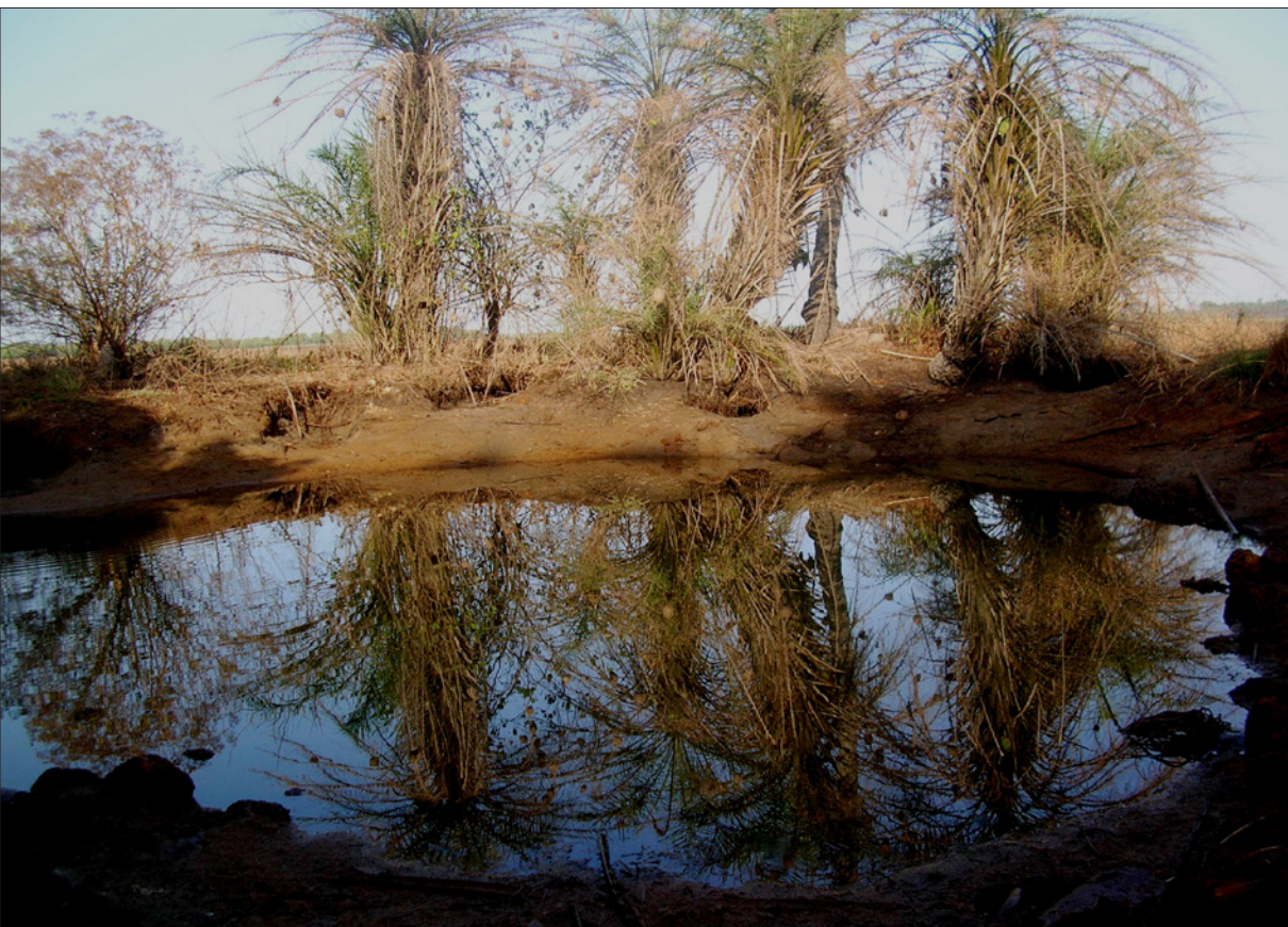
Fig. 11. Photo by Albat lalá (29 years old, farmer, primary school teacher, secondary school student)