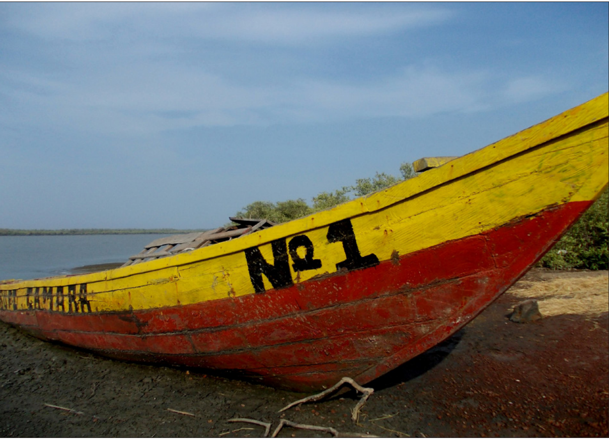
Fig. 6. Photo by Manuel Camará (75 years old, farmer, Independence War veteran)

My comrades, my brothers, my uncles, and my children, I will tell you the story of this motor boat, the first one in Cafine. In the past, we didn't have such motor boats. We would row all the way to Catió [neighboring peninsula] to take someone sick for treatment. It was very difficult. When there was wind, we would sail. But when the wind disappeared, no one could go anywhere. But today we have development. Motor boats are development. With a motor boat, no one gets tired [i.e., there is no difficulty]. Not unless the engine breaks down. I took this picture to show development, which feeds and helps us.