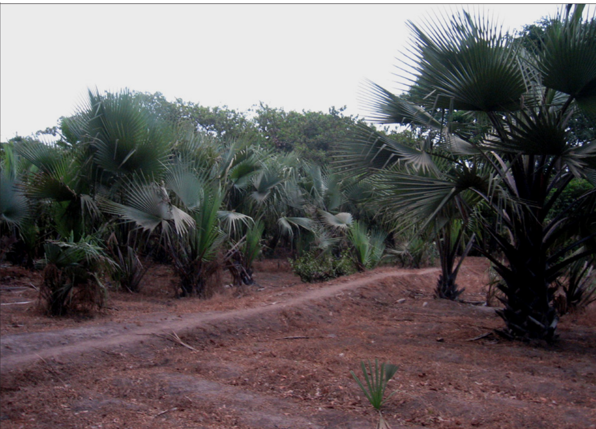
Fig. 15.

This is a cibe ( Borassus aethiopum ; a wild palm tree) plantation. Before, this was a rice nursery. The rice seedlings would be transplanted to the bolanha [mangrove rice field]. More than 10 years ago, the owner of this plot realized his land was degraded. So he had the idea of planting cibe, thinking that one day it would be worth money. He brought cibe seeds from a neighbor's plot and sowed it. This is how he managed to obtain a cibe plantation of this size. He discovered the value of cibe after traveling to Quínara and seeing that one cibe tree is worth CFA 10000 [EUR 15]. If it is felled and divided in boards, each boards costs CFA 500 [EUR 0.76]. Seeing that this is something that is very valuable, he decided to experiment and plant cibe on his plot. He is the first person in the region to do it, and without any NGO support. His children water the trees. This is a beautiful change because the land owner changed his land several times. It has been a clean space, with nothing, no trees, no grass, a rice field dominated by sand [erosion] - you can still see the parcels and the dike. Then the owner transformed that land into a rice nursery. Then he had wanted to make it a palm tree [ Elaeis guineensis ; for palm oil production] nursery. But when he discovered the value of cibe, he decided to experiment with it.