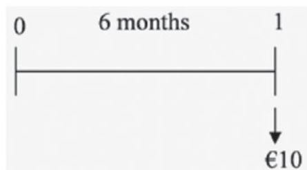
Figure 1. Expected pay-offs of the T-Bill.