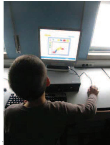
Figure 3. Task resolution through the applet.

The homogeneity of the groups was attested through analysis of the normality of the sample, as well as using the appropriate hypothesis test: Shapiro-wilk and the Mann-Whitney U test.