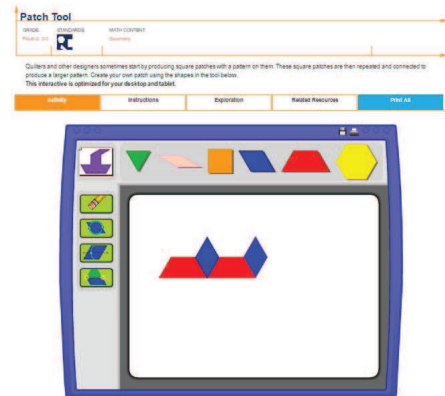
Figure 1. 'Printscreen' of the applet used in the study

In Figure 1 we present the 'printscreen' of the applet to which we used: