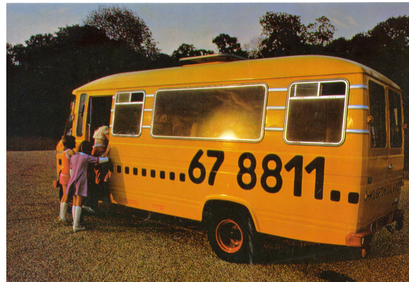
Fig 3: The 1975 Milton Keynes Dial-a-Bus

In 1975, Milton Keynes Development Corporation initiated a highly-subsidised, and popular, demand responsive 'Dial-a-Bus'. The scheme, which only covered a small part of the town, was scaled down and finally abandoned in 1980. In 1986 bus privatisation and deregulation rendered illegal the whole notion of a highly subsidised quality bus service. The 2004 Bus Strategy (Milton Keynes Council 2004), summarised post privatisation changes as follows: