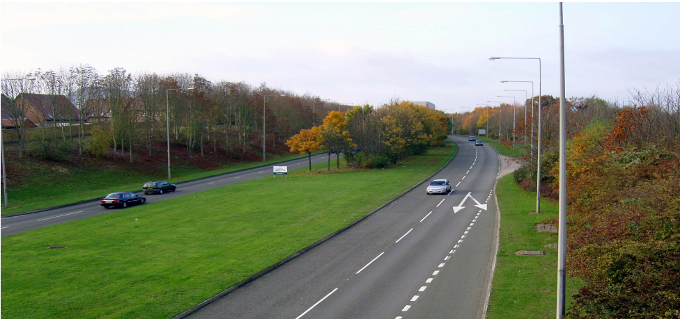
Fig 1: A typical Milton Keynes Grid Road

Predominant among the anticipated changes that the Plan for Milton Keynes addressed was the need for the urban design to accommodate 'saturation' levels of car use without road congestion. So, in the 1970 Plan for Milton Keynes , consultants Llewelyn-Davies designed a town around the operational requirements of the private car, so that people could be free to use the car as much as they chose. To facilitate maximum expected use of cars for peak-hour commuting, employment and all other major traffic-generating land uses were to be highly dispersed. Traffic was to be spread as evenly as possible across a non-directional grid of dual carriageway roads spaced one kilometre apart (Fig 1). Added to this, residential densities would need to be very low with an average of 27 persons per hectare, around half that of a normal UK city.