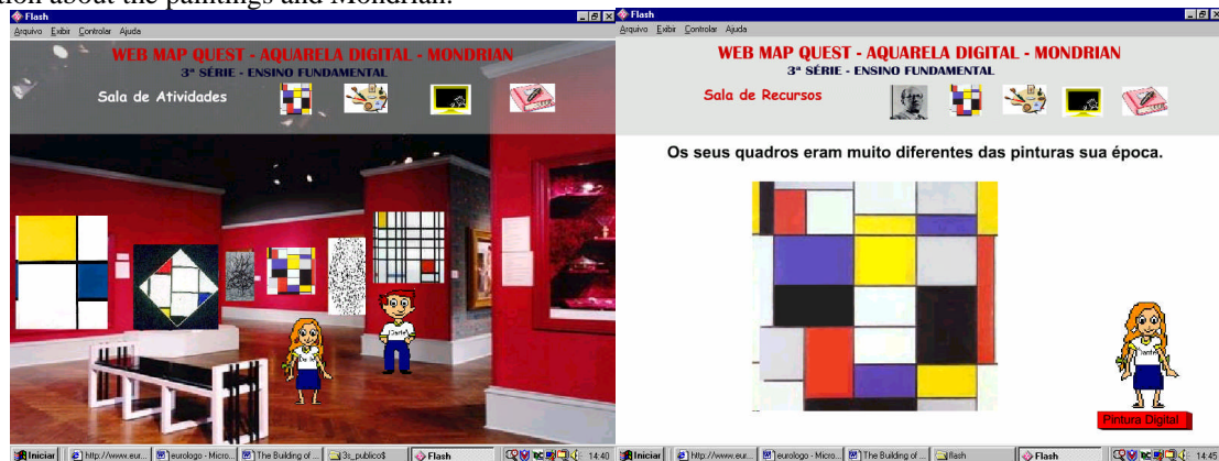
Figure 1: WebMapQuest – Building a Virtual Museum of Mondrian http://www.dantealighieri.com.br/WebQuest/Mondrian/mondrianfinal.html

The students accessed the Mondrian WebMapQuest, discovered the challenges and navigated in the map visiting some Virtual Museum with paintings of Mondrian. They created portfolios in which they collected information about the paintings and Mondrian.