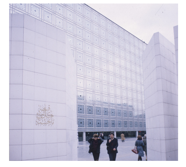
Figure 1 Institut du Monde Arabe: the south facade.

proposed a pattern that would be adjusted in response to variations in the intensity of sunlight.