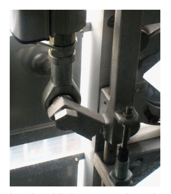
Figure 3 Mechanical diaphragms - image showing damage to the arm that transmits the force of the motor to the diaphragm actuation mechanism.

No discussion of the south facade is complete without acknowledging that the diaphragms failed to function as intended. It is not clear what part of this problem was due to faulty design and what resulted from a failure of the