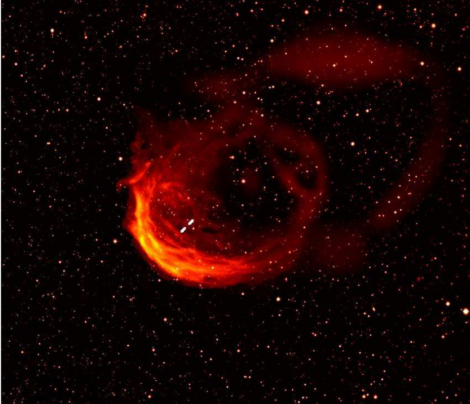
Figure 3. A combination of deep and shallow observations of Sh 2-188 showing the detail in the bright arc and the faint structure (with some blurring to allow combination of the images). The faint central star is indicated on the image between the markers. North is up and East to the left. This figure is a reproduction of figure 3 from Wareing et al. (2006a). Please consult that reference for full details.

is swept downstream in turbulent areas of high density and temperature. Sh 2-188 is yet to enter this stage.