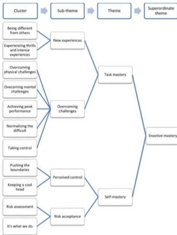
Figure 1. Interconnected experiential framework of clusters to themes to the "enactive mastery" superordinate theme.