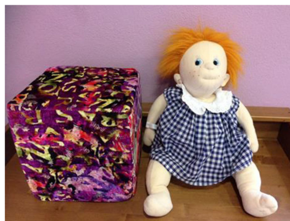
Fig. 2 The doll and the soft cube

The object (doll or cube) presentation procedure will be structured in five standard steps as follows: