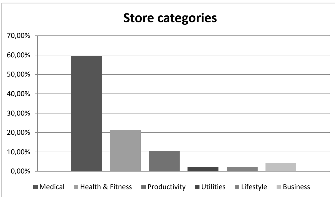
Figure 2 Distribution of the apps in the different store categories