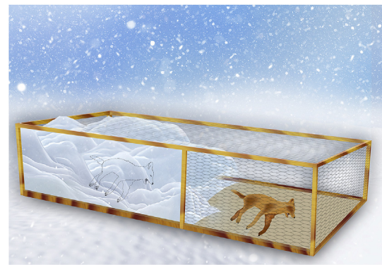
Fig. 1. Box containing the animal carcasses beneath and above the snow.