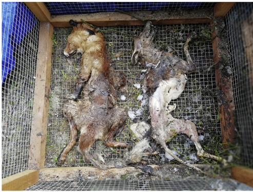
Fig. 3. Fox carcasses preserved above the snow (on the left) and beneath the snow (on the right) after 112 days.

was 5.5 times lower than that above the snow. Snow accumulation and density, both of which directly control the formation and persistence of the subnivium, are affected by ambient temperature, wind, snowfall, and radiation fluxes (Harestad and Bunnell, 1981). Deep, low density snow is most effective in maintaining the thermal stability of the subnivium (Ge and Gong, 2010). With warmer ambient temperatures, ablation increases, reducing depth and increasing snow density throughout the entire snowpack. Under colder conditions, the temperature gradient between the bottom layer of snow and the air temperature increases, which increases snow density at the surface of the snowpack (Kim and Jamieson, 2014). Despite increased density at the surface, air temperatures at or below 0 °C prevent the occurrence of surface snow melt and support the retention.