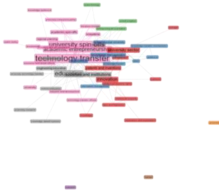
Figure 1. Topics of research on the spin off and university

In Italy the number of spin-offs still appears to be still limited compared to the potential held in universities scattered throughout the peninsula (Iacobucci & Micozzi, 2015). This is because the whole system is still relatively new and little used by the operators in the sector and, moreover, in order to observe the results of the efforts made in creating a spin-off, waiting times are quite long and difficult to analyze for the singularity of each spin-off. Especially when you observe the time necessary for a new company of this type to be able to detach itself from its mother university and become independent, or how long it takes the young company to get investments and have its own capital and available means, the precise estimate is difficult (Colletti G., 2018).