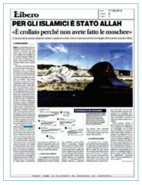
Figure 3. Front page of the newspaper Libero, 17August 2018.<sup>23</sup>

Previously, at the beginning of February, a journalist of Il Foglio published the book Il suicidio della cultura occidentale: Così l'Islam radicale sta vincendo (The Suicide of Western Culture: This Is How Radical Islam Is Winning). The thesis of this book is a "typical" topic: the threat of Islamisation towards Europe, and the defeat of Christianity and Western cultures because of our "multiculturalist" decay and softness.