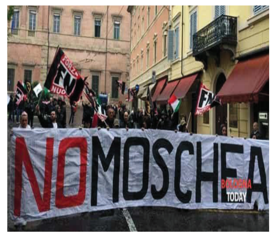
Figure 1: Protest against the mosque in Bologna by Forza Nuova (6 October 2018),<sup>20</sup>

ers have been very active. The militants of extreme right parties, Forza Nuova and Fratelli d'Italia, organised different manifestations against the opening of Islamic centres or mosques, and the presence of Muslim communities. For example, on 6 October, in the city of Bologna, Forza Nuova organised a demonstration against the construction of a mosque and displayed banners against Archbishop Matteo Zuppi calling him a "heretic" because he was in favour of a dialogue with the local Muslim community. (Fig. 1) In January, before the electoral campaign, activists of Fratelli d'Italia, in a small city close to Florence, affixed big posters in the area where the local mosque would be built with the claims "No Mosque" and "Italians First".<sup>18</sup> In June, counsellors of the Municipality of Naples exhibited a big banner with the writing "Islam's Square" (instead of "Garibaldi Square") fuelling an argument with the Mayor of Naples Luigi De Magistris, who is considered "guilty of permitting the historical centre of the city to completely change because of the uncontrolled arrivals of asylum seekers and illegal migrants".<sup>19</sup>