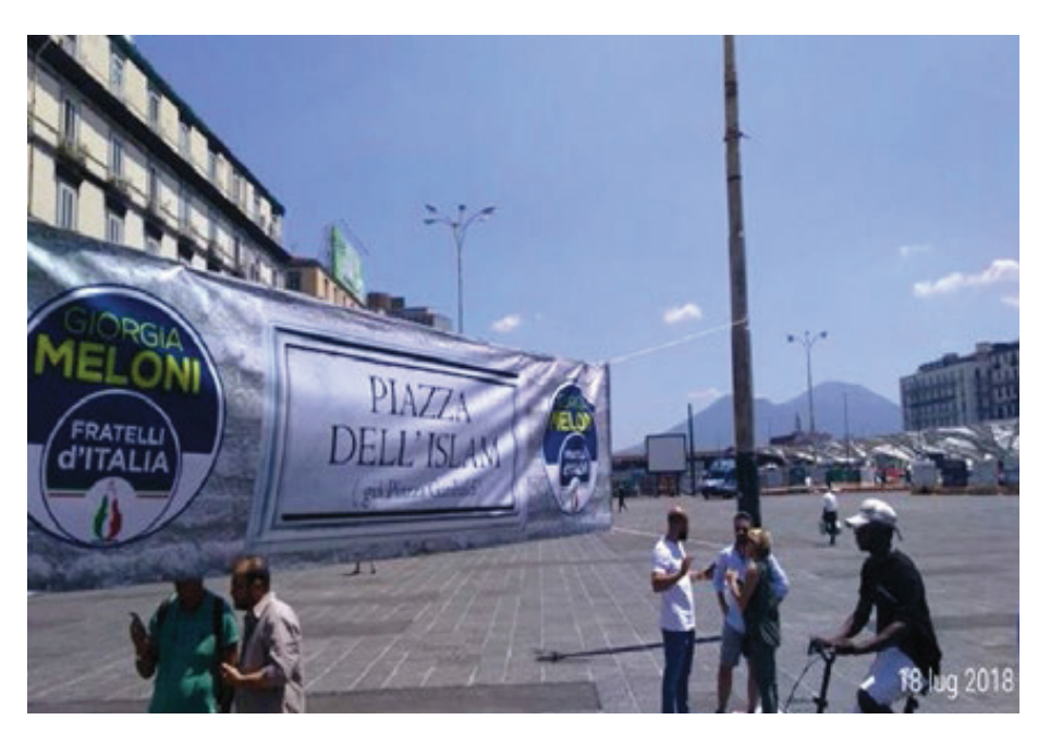
Figure 2: Large banner affixed by Fratelli d'Italia in a central square in Naples (18 July 2018).