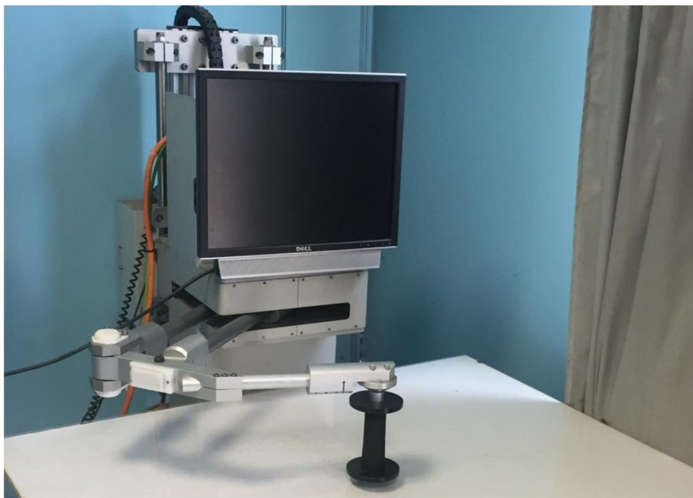
FIGURE 2 | Picture of the robot used in the present study.

the passive session. Furthermore, the post-training phase of the active session was significantly different from all the other conditions ( p always <0.01 for each comparison; percentage score relative to each participant's subjective arm length, mean \pm SD: pre-training active = 46.4 \pm 6.7 ; post-training active = 54.7 \pm 7.3 ; pre-training passive = 47.8 \pm 5.6 ; post-training passive = 47.4 \pm 8.7 ).