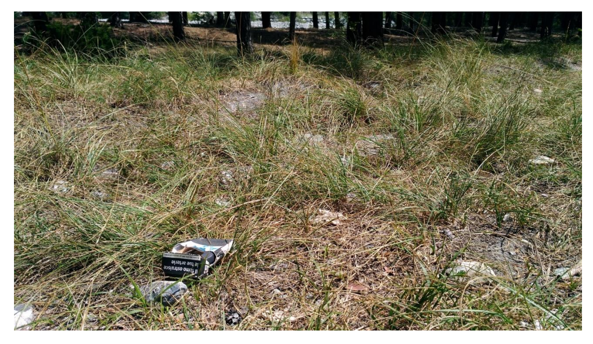
Figure 4 – Traces: an empty pack of cigarettes in the woods