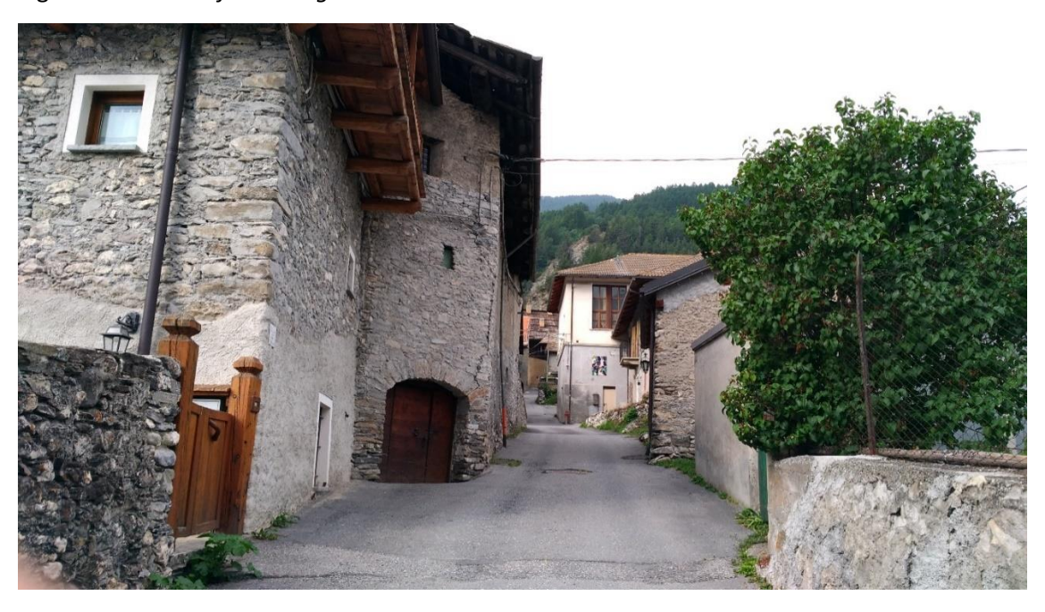
Figure 1 - A view of the village