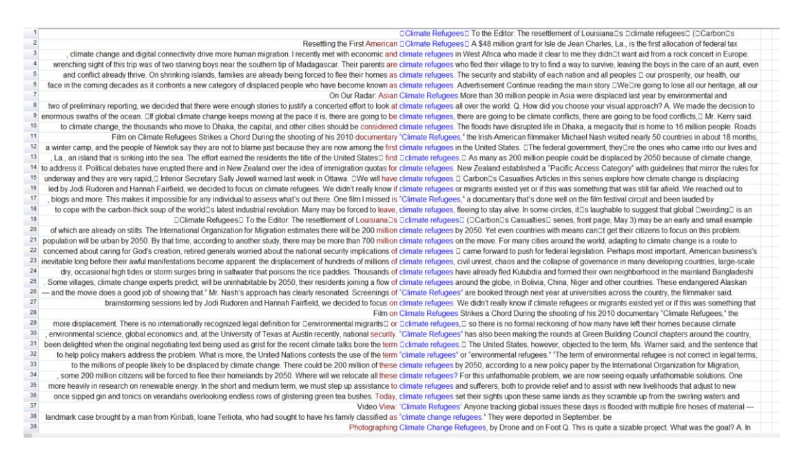
Fig. 2. Combined concordances of climate change refugee* and climate refugee* in The New York Times corpus.