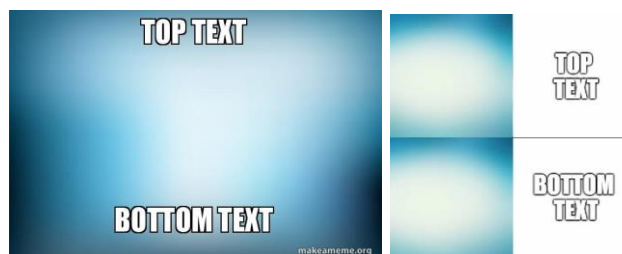
Figure 1: Two prototypical meme structures

They are deeply rooted in visual media culture and catch users’ attention with their puzzling vibe that calls for the active contribution of the viewer to unlock the meaning and thus adds a gratifying flavour. Internet memes are created by users according to collectively established and shared rules that govern the so-called memesphere : these rules dictate the conventional meaning of the pictorial parts and the position, font, syntax and narrative structure of the text, they “cannot be enforced by a specific person, but the community sanctions wrong uses by downvoting, not liking or simply not spreading the misused meme” (Osterroth, 2018, p.7). These same rules shape meme generators websites as https://imgflip.com/mememplates or https://makeameme.org/ : there are several accepted structures, two of the most common being those in Figure 1.