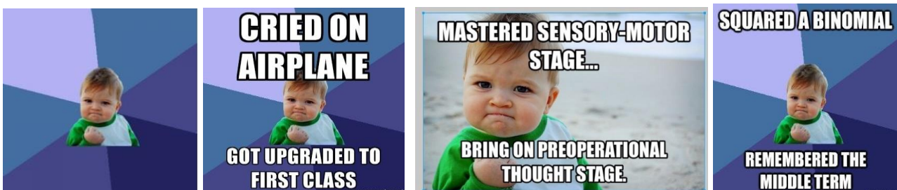
Figure 2: Template and propagation of the Success Kid meme

Pictorial parts, usually identified with names, might have local or global recognisability: in Figure 2, a blank template of the Success Kid meme - globally used to boast of something good - is shown, followed by a general example of the meme propagation by imitation and an example of its psycho-pedagogical adaptation, to end with its mathematical variation.