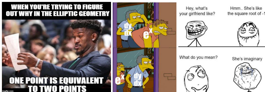
Figure 5: Example 1 (left), Example 2 (centre), Example 3 (right)

Reveal app to a smartphone, following lifeonmath and then scanning the images in Figure 5 – due to monitor light reflections, it works better with printed images).