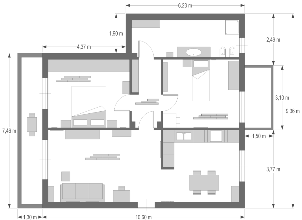
Figure 1: Floor plan of the apartment chosen as a case study. Wood based products are colored in light grey. All furnishings are drawn in scale, except for frames that have been enlarged to be more visible. Baseboard is not shown for easier readability, anyway it is present in each room in which parquet flooring is illustrated. Grey color on windows represents the roller shutter boxes.

Reference examples of residential furnishing in northern Italy are not available, due to the large amount of variables involved. Anyway, the apartment selected contains the typical furnishings that one can expect in residential housing in this region. For instance, taking student housing as a specific case of residential housing, the furnishings of the apartment are in line with those envisaged by the “rental agreement type” of the City of Padova, northern Italy, for a type apartment to be rented to students (Comune di Padova 2017).