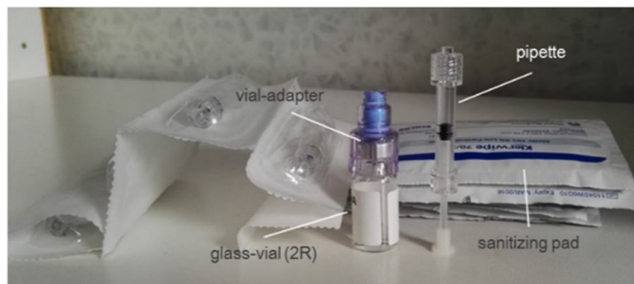
Figure 3. Oxervate® administration kit.

contains 1.0 mL of the product. The ocular administration of the drug product is achieved by means of a plastic vial adapter positioned on the stopper head to which a polycarbonate pipette (with a capacity of 120 µL) is connected in order to withdraw the solution and deliver a drop of liquid into the eye. Six administrations per day from a single vial and using 6 pipettes are carried out (daily multidose vial).