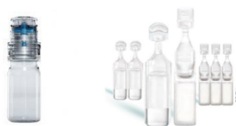
Figure 1. Preservative free multidose and BFS monodoses.

Topical eye drops are the most convenient and patient compliant route of drug administration, especially for the treatment of anterior segment diseases. More than 70% of ophthalmic drug products are simple solutions supplied in multi-dose plastic container closure systems (CCS), which generally contain a weekly or longer supply of the drug. These products may be intended for the treatment of acute or chronic conditions. In the 1950's, the introduction of the use of preservatives in ophthalmic products to prevent contamination after opening constituted a considerable advance, allowing the use of multidose containers. Thirty years later, numerous publications have shown the unfavorable effects of preservatives on the cornea, the conjunctiva and the tear film, causing irritation, inflammation and dry eye. In order to avoid this problem, single sterile dose units were put on the market (i.e., blow, fill seal (BFS) technology). From the 1990's, also multi-dose bottles (Figure 1) capable of dispensing preservative-free eye drops (PFMD) appeared on the market: the first was ABAK ® system from Thea, followed by a series of preservative-free packaging forms such as OSD ® Aptar and Novelia ® Nemera technologies.