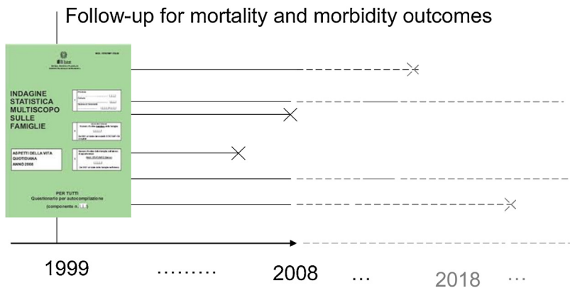
Fig. 2. Graphical representation of the cohort together with the follow-up.

To reduce model uncertainty, a data fusion technique is used to combine MINNI concentration fields and pollutant observations. Thus, it is possible to provide a more realistic representation of pollutant spatial distribution. Due to the nature of the health data, only background stations have been considered to integrate CTM models. Observed data introduced in the dispersion model outputs are retrieved from the Italian regional environmental agencies BRACE database (The national system: http://www.brace.sinanet.apat.it/ ) and from the European Air Quality dataset AirBase (The European air quality database: http://www.eea.europa.eu/data-and-maps/data/airbase-the-european-air