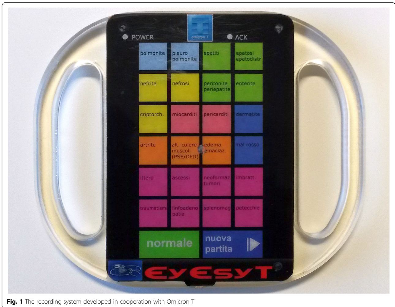
Fig. 1 The recording system developed in cooperation with Omicron T

Neumann et al. [14] found a prevalence of pleurisy, pneumonia and pleuropneumonia of approximately 16%. This prevalence is slightly lower than the one found in the present study, which can be explained by the lower age and weight of their animals at the time of slaughter.