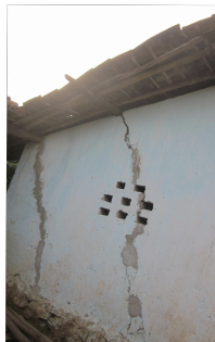
Figure 3: Cracks in the walls of the house due to the blasts in the mines.

The influence of mining on environment: The most visible impact/ damage are to the landscape by the mining process. The spilled oil, grease and other contaminants finds their way in to the nearby fields and water courses, causing health hazards to inhabitants, cattle and damage to standing crop etc. The mechanized mining and processing of mineral causes air pollution due to emission of dust from drilling, blasting, loading, transport of mineral by dumpers, dumping operations, crushing and further handling operations. The noise level goes up due to the drilling, blasting, operation of diesel engines, machinery operations, loading and crushing operations. The blasting fly rocks in the nearby fields causing fear among the villagers, as it brings destruction to life and property.