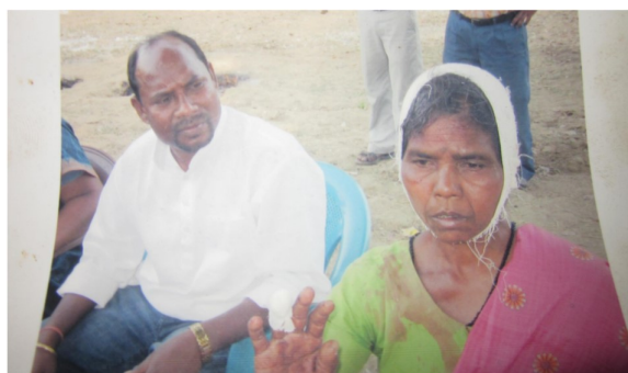
Figure 2: A Female brutally attacked by police in 2002.