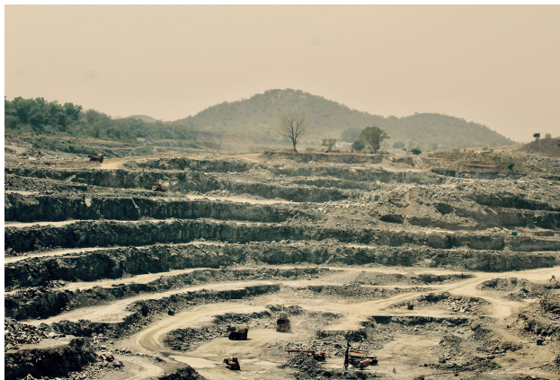
Figure 1: OCL Mining Site, Lanjiberna.

Prior to Independence the industrial activities in Sundergarh were confined only to Birmitrapur, the site of the limestone quarry. The establishment of the cement factory at Rajgangpur in 1951 and the steel plant at Rourkela in 1955 were mainly responsible for rapid industrial development in the district. During the past decades large, medium and a number of small-scale and ancillary industries in and around Rourkela began to concentrate and created an industrial complex. All the large-scale industries of the district viz., (i) the steel plant at Rourkela (ii) The fertiliser plant at Rourkela (iii) Cement factory at Rajgangpur (iv) Messar Utkal Machinery Ltd., at Kanshbahal (v) The limestone Quarry, Bisra, are in the complex. Sundergarh has emerged as one of the industrially advanced districts of Odisha. Industrial activities including mining and quarrying engaged 56,044 persons (17.29 percent of the total working population) in 1971. The Odisha Cement Limited (OCL), was established at Rajgangpur in pursuance of an agreement in December, 1948, between the State of Odisha and M/s. Dalmia Jain Agencies Limited (now M/s Dalmia Agencies Private Limited originally Managing Agents of the Company). Limestone, the principle raw material for manufacturing cement, is obtained from the company's own quarries at Lanjiberna situated at a distance of about 10 km, from the factory site (Mining Plan, 1989).