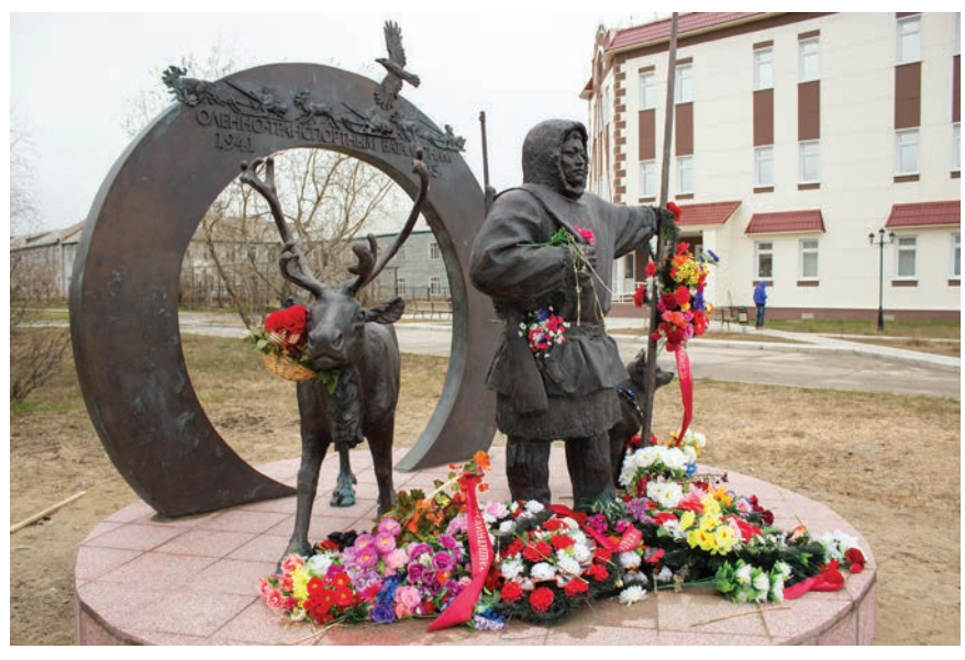
Figure 2. The monument for the reindeer fighting brigades in the city of Naryan-Mar.

especially if their elements are inherited from the Soviet Union, to their ideological function of delegitimization or even repression of alternative or dissident personal and communal visions of history (cf. e.g., Jaago and Kõresaar 2008:18). The institutional level introduced by Portelli (Jaago and Kõresaar 2008:19) seems to represent the public transcript of ruling elites while the perspectives of the subordinated remain hidden (Scott 1990; but see the critique of Ortner 1995) or as Cruikshank (1992:22) puts it: