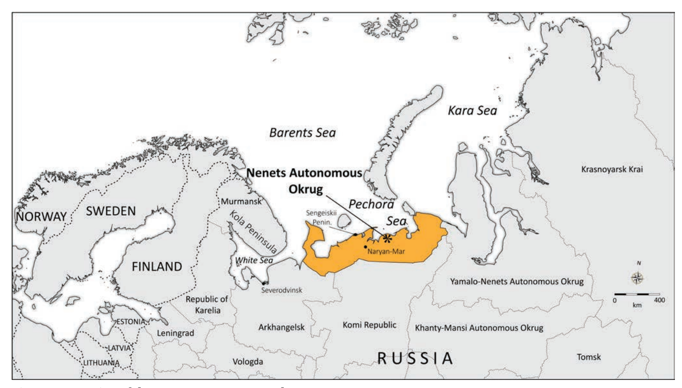
Figure 1. Location of the Nenets Autonomous Okrug.

interlocutor showed no interest in or was even hesitant to speak about.