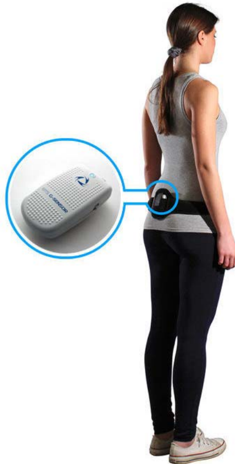
Figure 1. G-walk device and its positioning.

supine and quadruped positions ( Figure 2 ). The aim of the BG is to improve postural stability using bi- and mono-podal exercises on unstable surfaces ( Figure 3 ). Each exercise includes 3 sets, 10 \pm 2 repetitions and 1 resting minute between sets.