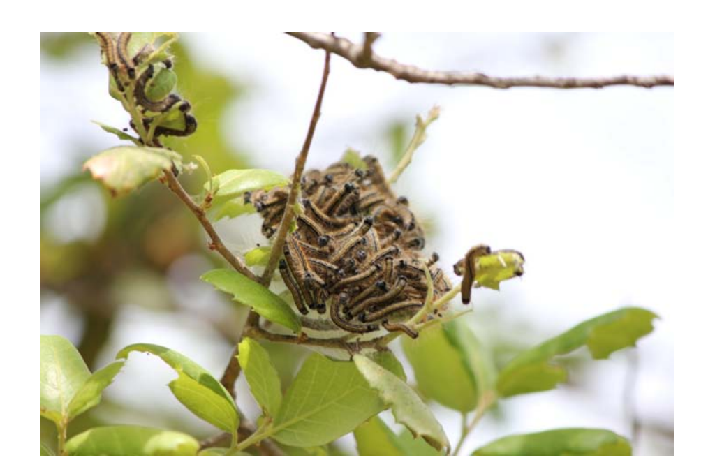
Session 1: Ecology, ecophysiology, health and genetic resources