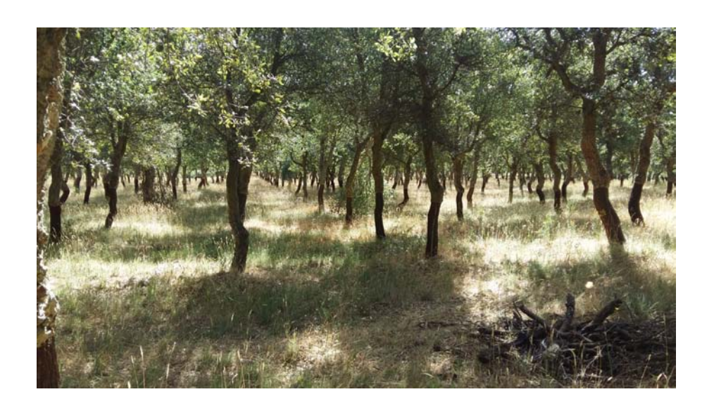
Session 2: Forest monitoring and management, land and forest planning