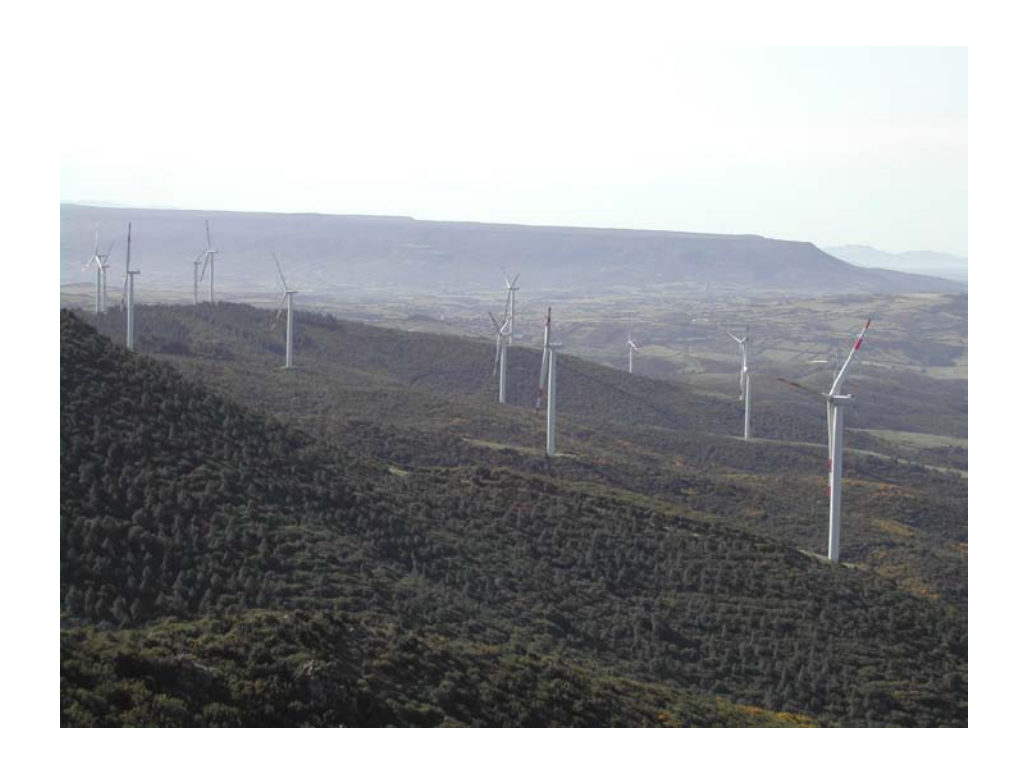
Session 4: History, economics and policy, social perception and communication, certification