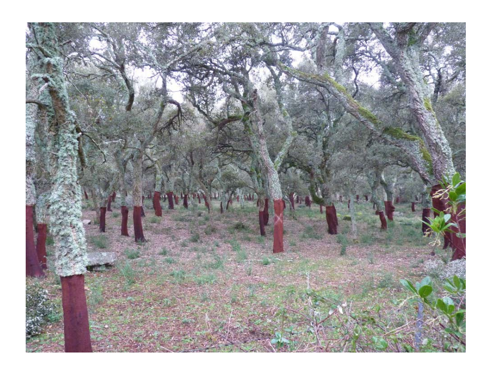
Session 2: Forest monitoring and management, land and forest planning