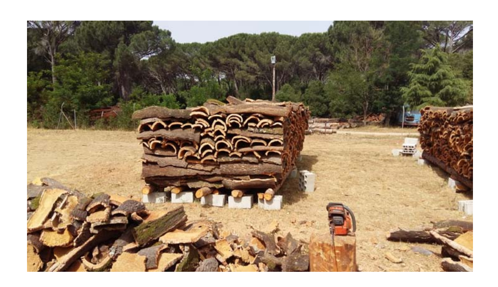
Session 5: Cork supply chain technology, supply chain arrangements, markets and trade foresight, product and process innovation