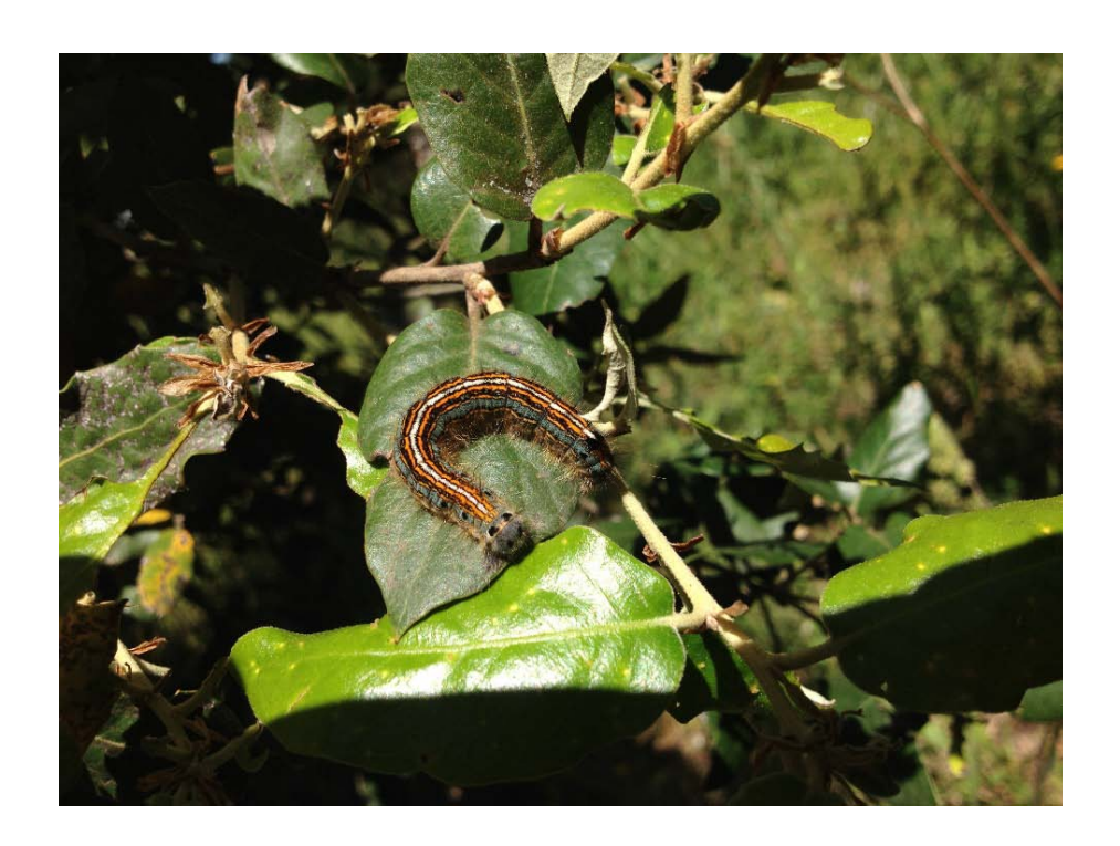
Session 1: Ecology, ecophysiology, health and genetic resources