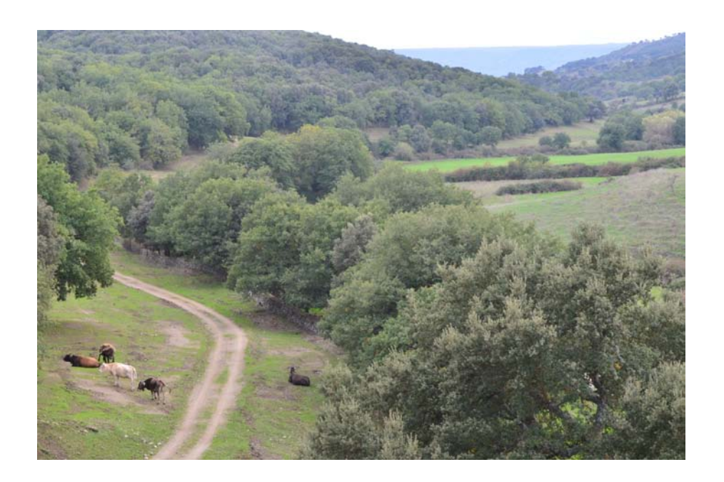
Session 3: Multifunctionality of cork oak systems, biodiversity, climate change mitigation and landscape/ecosystem services