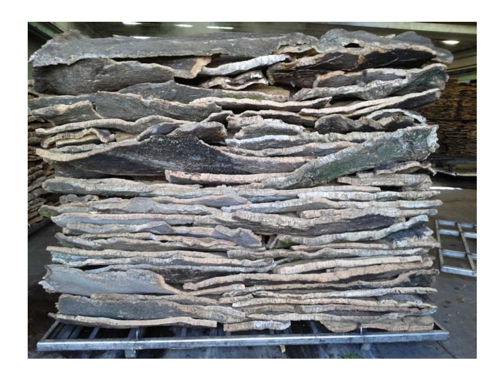
Session 5: Cork supply chain technology, supply chain arrangements, markets and trade foresight, product and process innovation