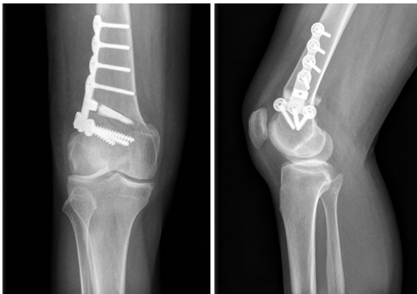
Figure 2 Post-operative X-rays (AP view on the left and lateral view on the right) of a lateral opening-wedge DFO stabilized using a Puddu Plate.

osteotomy healing (14). Figure 2 shows a post-operative x-ray of a lateral opening wedge osteotomy.