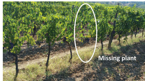
Figure 4. A typical vine row in the Bulichella vineyard. The vegetation from neighbour vines has partially covered the missing plant position.

These two variables describe the shape of the single vine and account for possibly different patterns of canopy cover in case of shoots and foliage originating from neighbour plants.