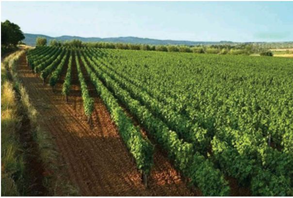
Figure 1. Typical vineyard managed with the guyot training system. Vines are planted in rows and the vegetation is organized in continuous canopies.

the case of lack of a plant, the neighbouring plants can extend their shoots and foliage up to occupy the free space between two vines.