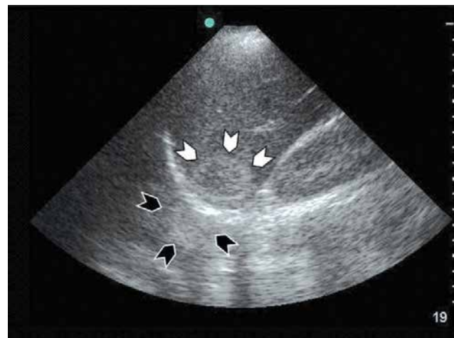
Figure 3: Mirror image