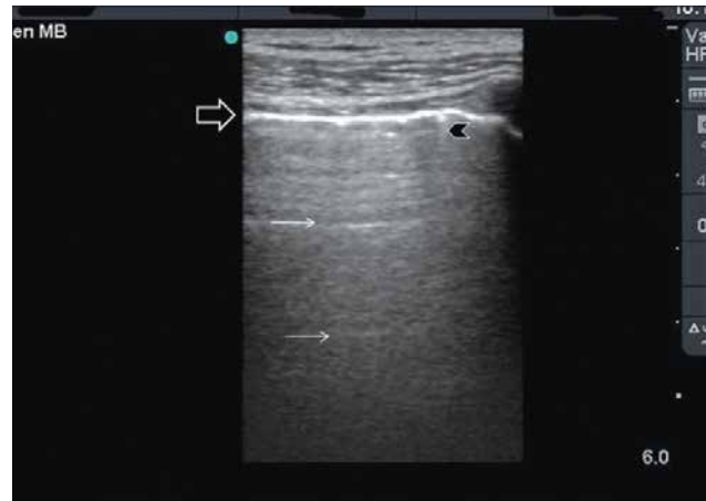
Figure 2: Reverberation