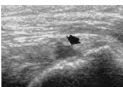
Fig. 2. Tear (→) in the supraspinatus tendon.