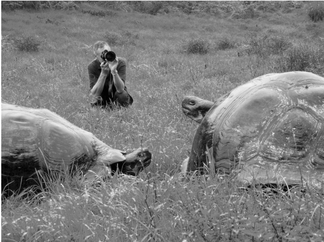
Figure 7 – Masculine contact with the wildlife