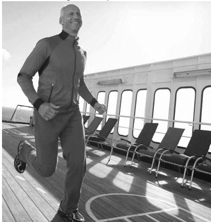
Figure 6 – A dynamic senior