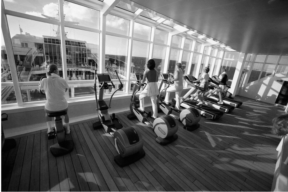
Figure 3 – Stationary and travelling bodies training in a gym