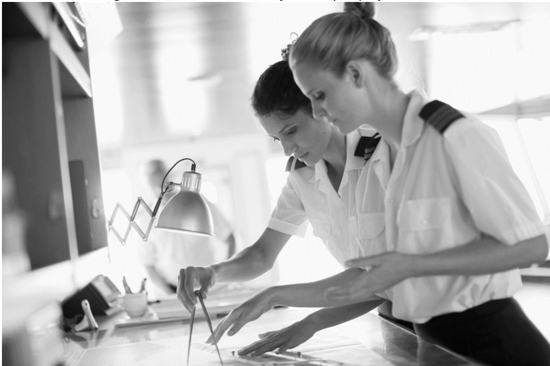
Figure 5 – Counter-narratives: femininity as professionalism