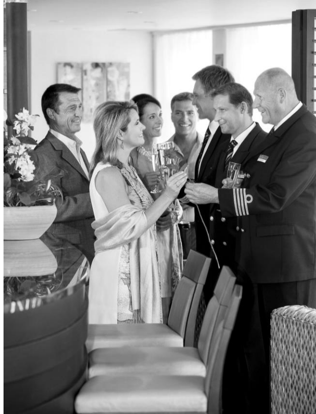
Figure 4 – Masculinity as safeness, reliability, and professionalism