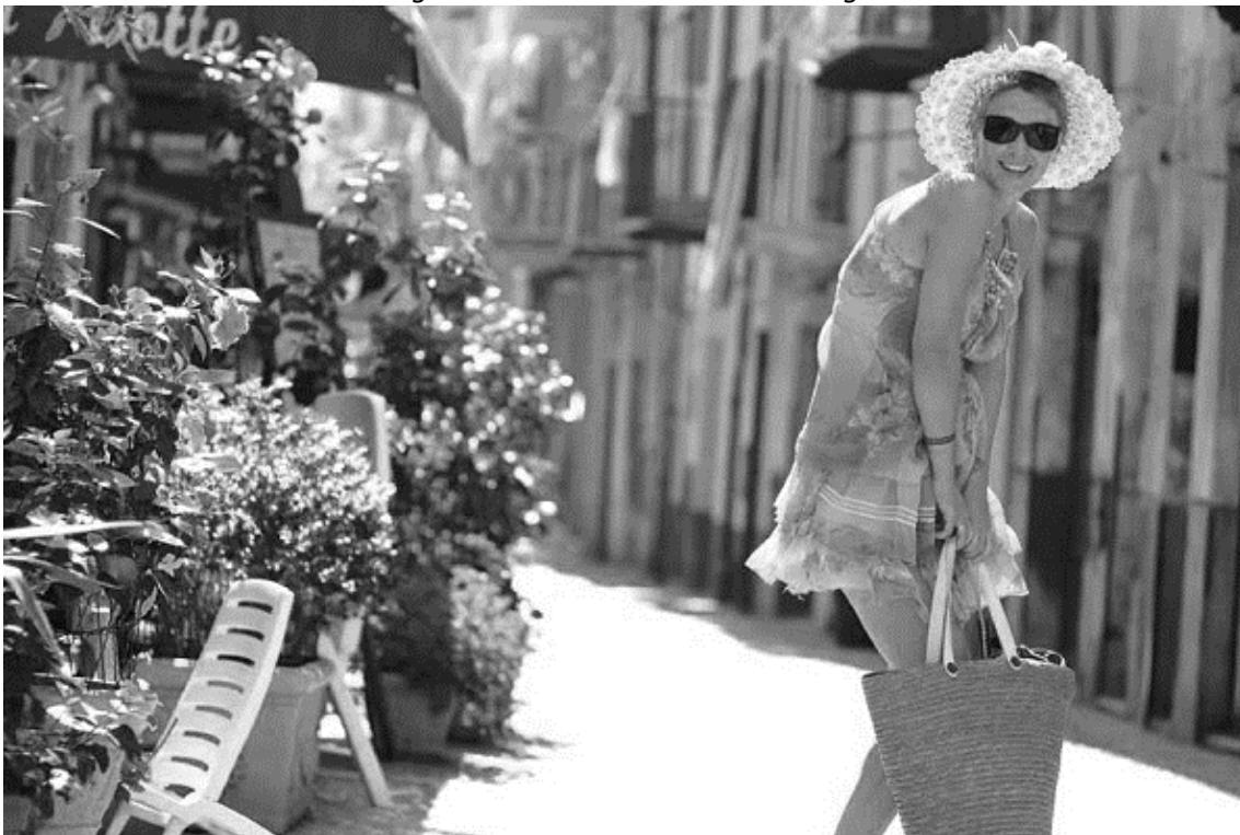
Fig. 8 – Feminine contact with a bag