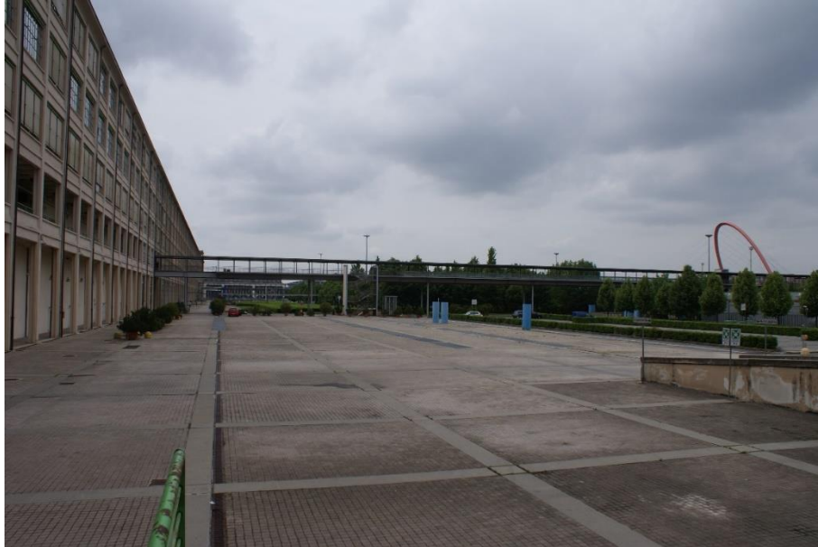
Figure 8. Lingotto, the pedestrian bridge and the Olympic arch

walking outside. The bridge metaphorically connects Lingotto with the 'ordinary city' (a residential area with relatively low real estate value); or, walking in the opposite direction, walking through the bridge and passing the arch may be seen as a sort of rite of passage allowing the entering into the 'new' urban space of consumption, of high-quality food, culture and sport – all keywords of the contemporary development strategies of Turin.