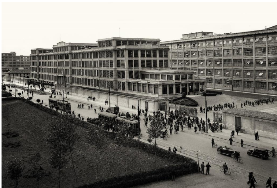
Figure 1 – Lingotto in 1931

Our analysis of the archive material clearly points out that Lingotto has been originally intended to be a flagship industrial project for the whole city and, more broadly, for the entire country. At the beginning of the twentieth century, Lingotto was portrayed as a highly technological and modern industrial space, testifying the greatness of Italian engineering and technology and the primacy of Turin as a modern, industrial and productive city (cf. Olmo, 1994). It is not a coincidence that important personalities of the era celebrated the opening of the factory, and that its images have been proposed, for example, by Le Corbusier in his pivotal book Towards a new architecture (1931, p. 287). Lingotto was specifically built to be a glorious symbol of the Fordist age: an entire, huge, building devoted to the logics of the assembly line, industrial work and car production (Figure 1).