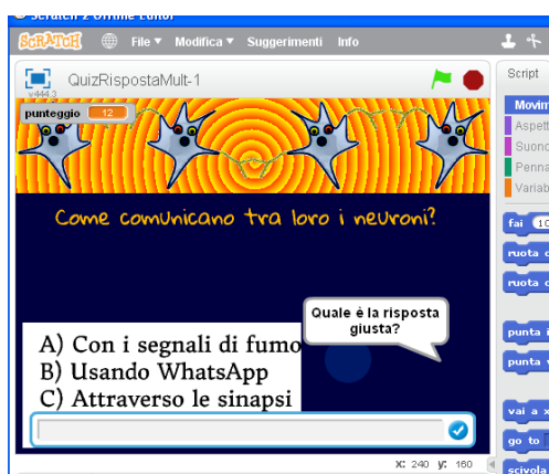
Fig. 3. “How do neurons communicate?”

This example has been shown in the meetings of the PP project with similar but much simpler activities. In fact for each activity type, because of the short time available, it was decided to start working on one or more canvases showing an example of the activity.