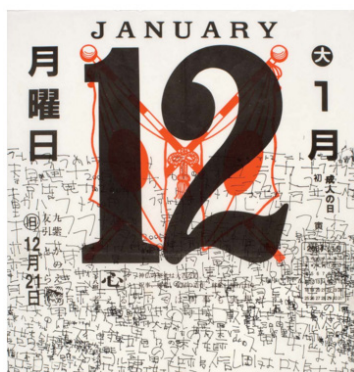
Fig. 2. Kunizo Matsumoto, untitled (1554) © ART BRUT – collection abcd, Montreuil.

From a topological perspective there is no doubt that the texts in question aim to saturate the writing surface, where full spaces prevail over empty spaces to an overwhelming extent, to signify a sort of irreversible branding of the support by the artist. Nevertheless one notices, in certain series, the expression of a kind of iconic “respect” towards the semiotized area. In the case of the calendars presenting decorative frills (see fig. 1), for example, these frills are never marked by the glyphs but are accurately avoided instead, as if to honour the intrinsic harmony of the support. On the contrary, as far as concerns the calendars without images (fig. 2) but showing the dates in cubital characters, the artist invades the space already occupied, writing over them, but interrupting his calligraphic outburst when he comes to the more visible paratextual ideograms situated at the top; nevertheless it should be highlighted that this occurs only in certain series of works, while in others the page is regarded as a “signable” surface in its entirety, as in fig. 3, where the only differences to be found in the support are the absence of the red design behind the central number and the utilization of a blue font. The page is therefore treated with a certain semiotic reverence out of respect for the signs which, in order of size but also of meaningfulness, already inhabit